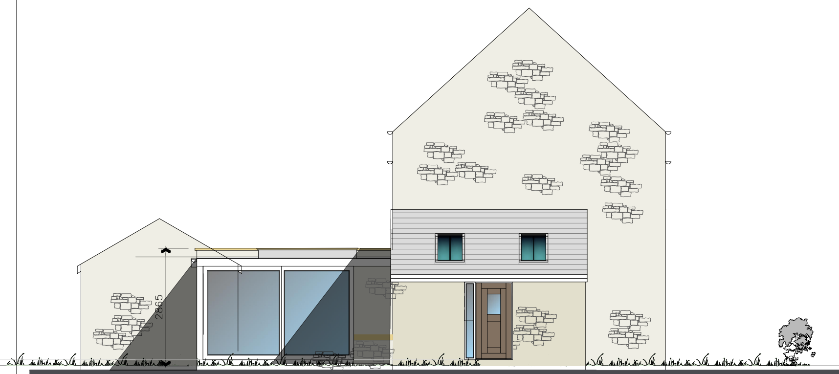
ELEVATION FROM THORNLEY-WITH-WHEATLEY