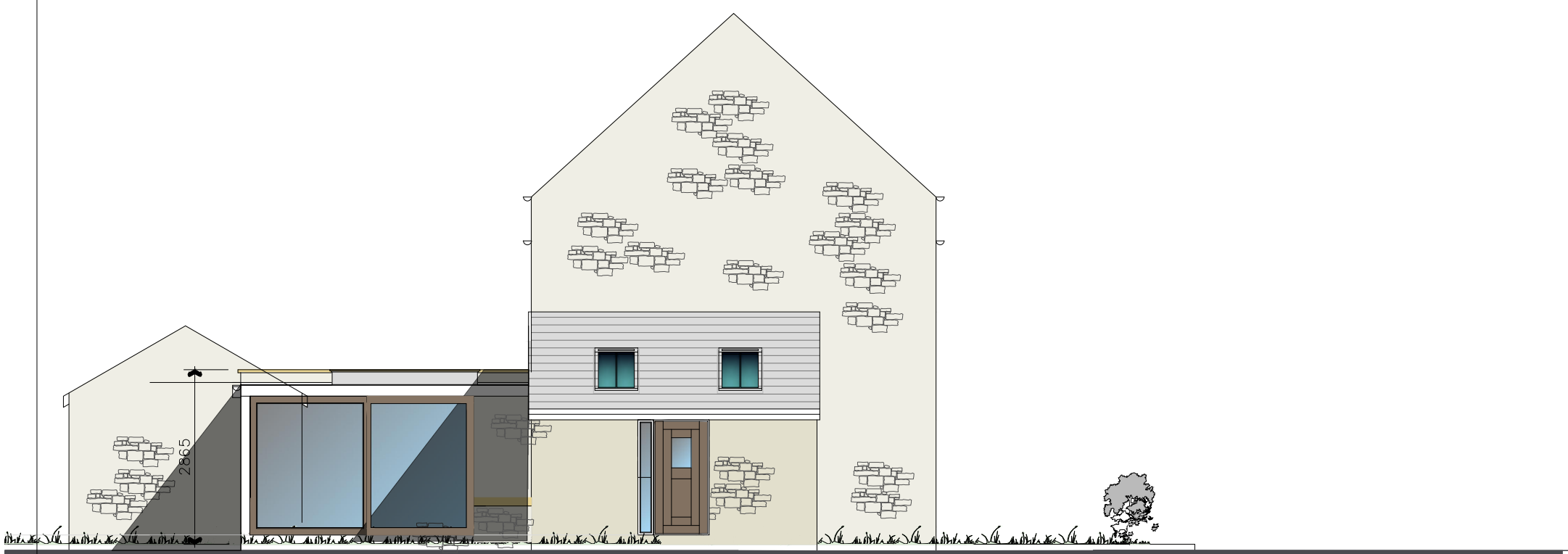
ELEVATION FROM THORNLEY-WITH-WHEATLEY