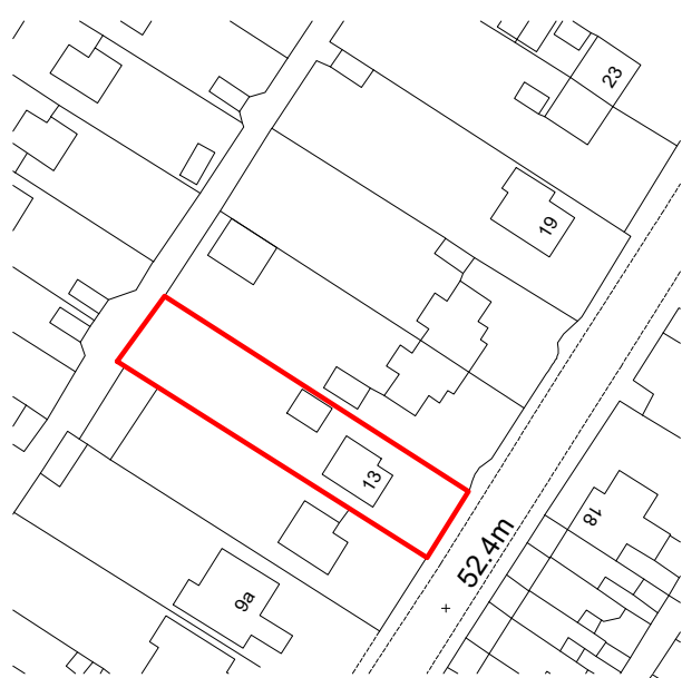
LOCATION PLAN SCALE: 1:1250@A1