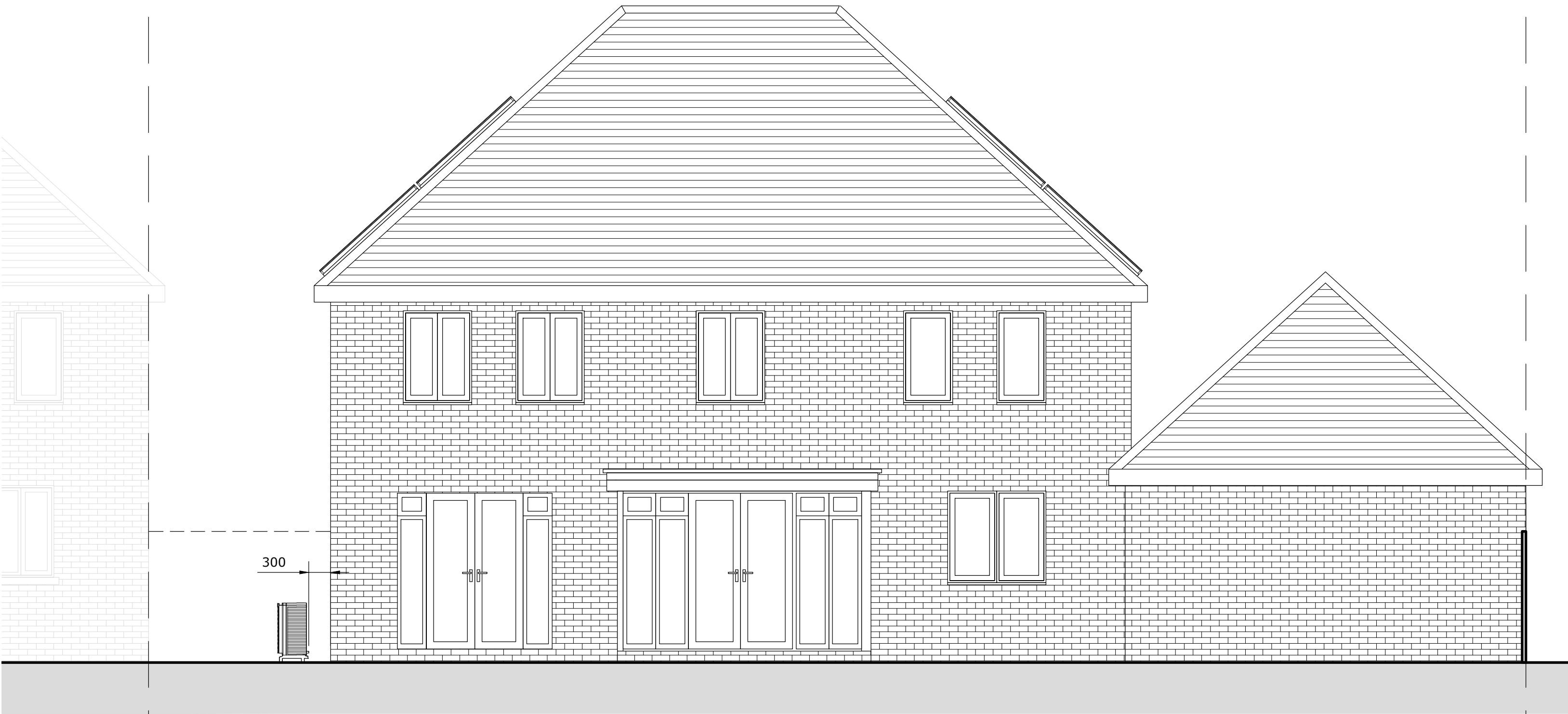
North Elevation as PROPOSED 1:50