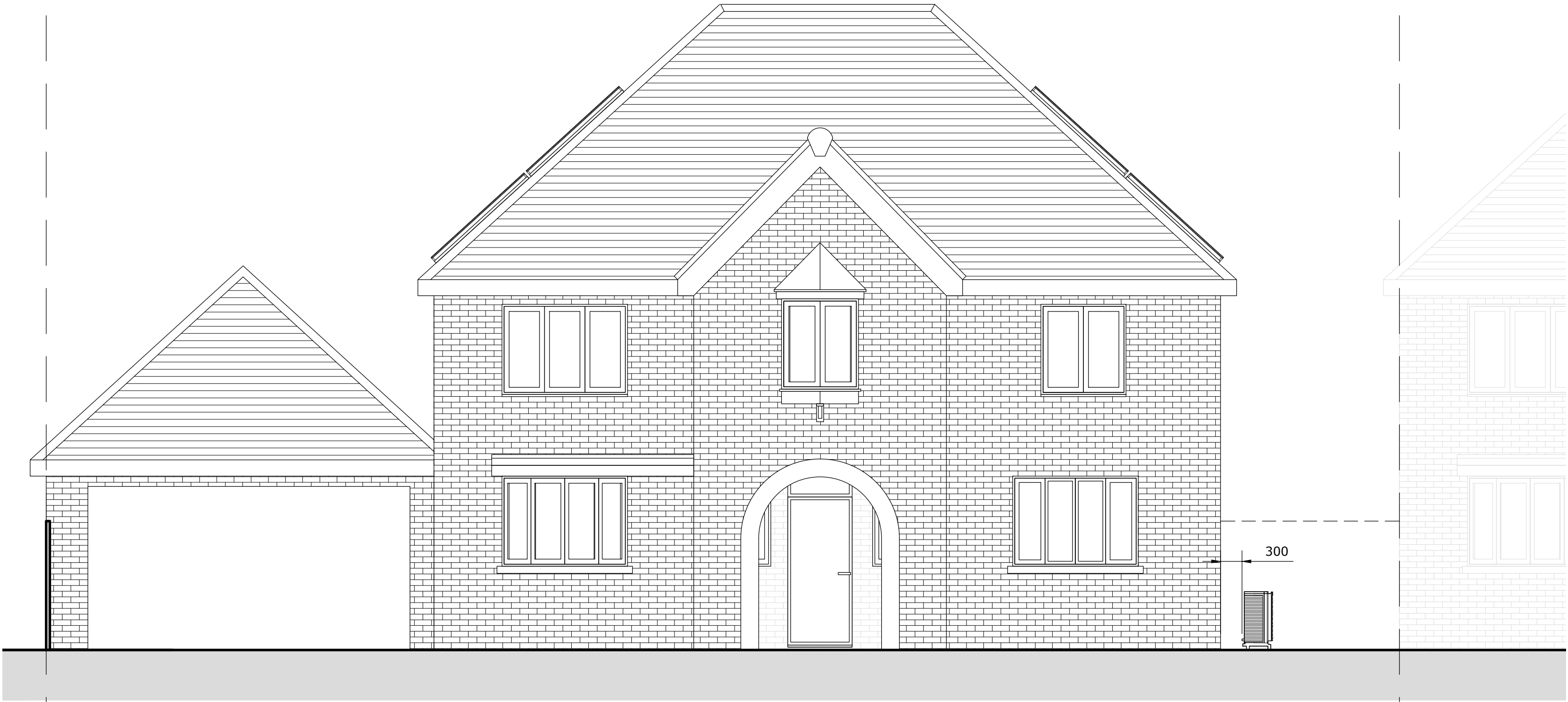
South Elevation as PROPOSED 1:50