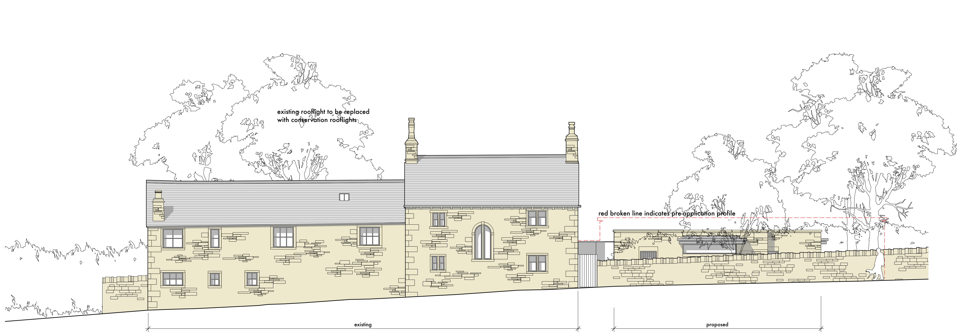
north west elevation

proposed NW elevation partially screened by existing stone boundary wall and hedge fronting Rimington Lane.