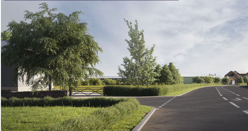
Proposed view from Preston Road/ Pinfold Lane