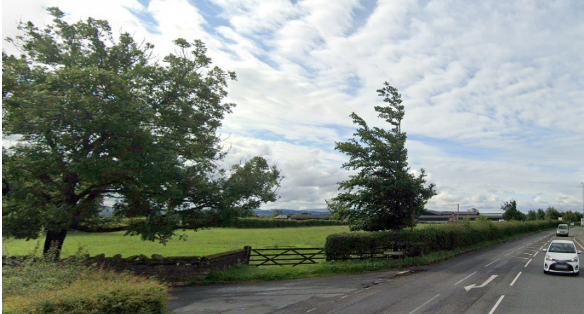
Existing view from Preston Road/ Pinfold Lane