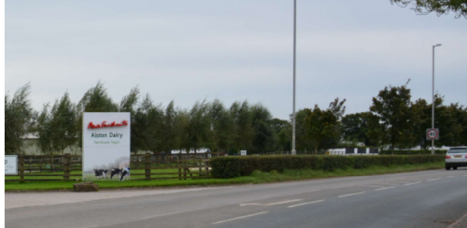
Existing view from Preston Road