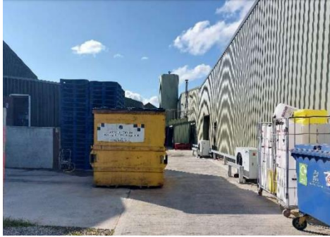
Image 1. Location of existing bins associated with the dairy.