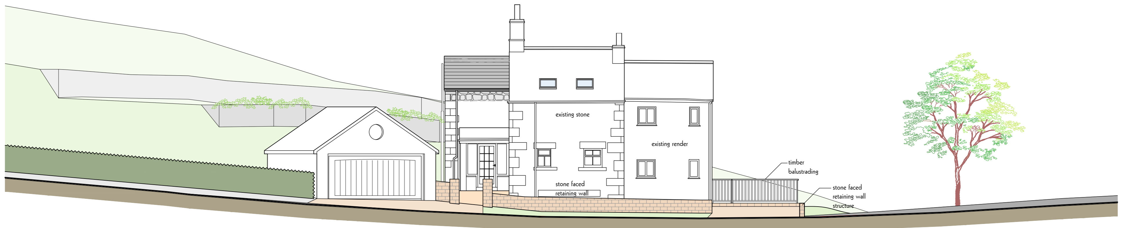
North West Street Scene - Proposed