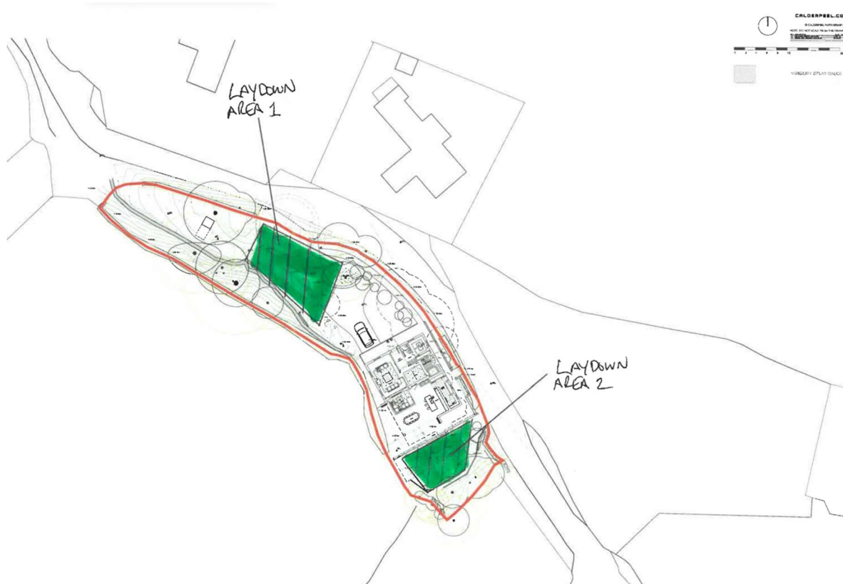
Fig 02. Laydown areas