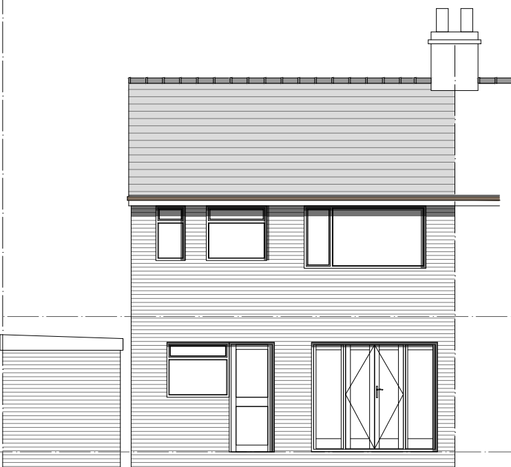
S O U T H E A S T