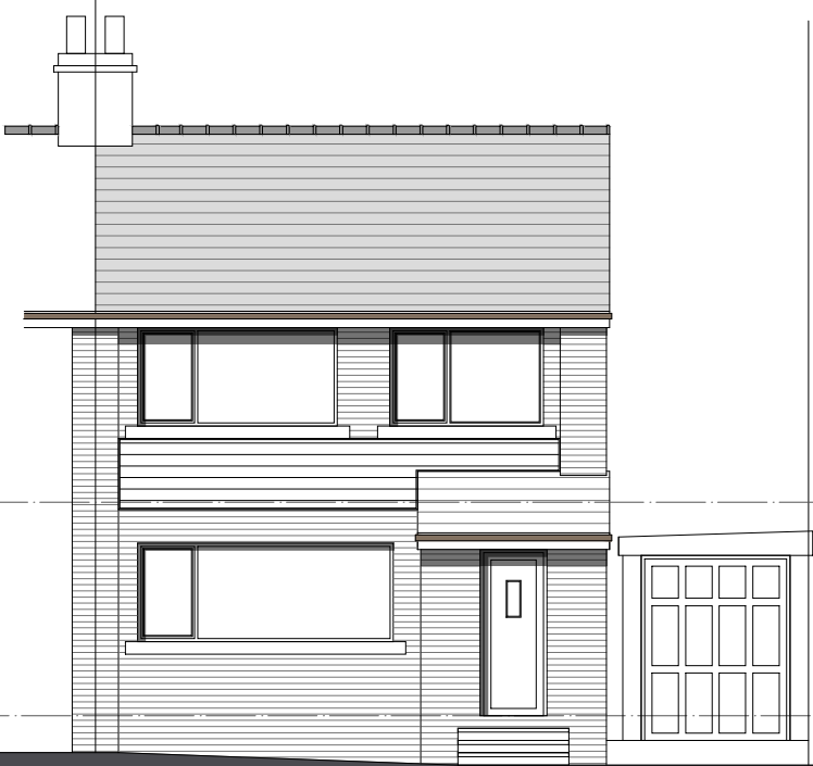
N O R T H W E S T

NOTES THIS DRAWING IS TO BE READ IN CONJUNCTION WITH ALL OTHER DRAWINGS FOR THIS PROJECT. ALL LEVELS AND DIMENSIONS ARE TO BE CHECKED ON SITE BY THE CONTRACTOR, PRIOR TO PLACING ORDERS OR COMMENCING ANY OF THE RELEVANT WORKS. ALL DIMENSIONS ARE IN MILLIMETRES UNLESS STATED OTHERWISE. ANY DISCREPANCIES BETWEEN THE INFORMATION SHOWN ON THE PLAN AND THAT FOUND ON SITE ARE TO BE REPORTED TO THE DESIGNER IMMEDIATELY.