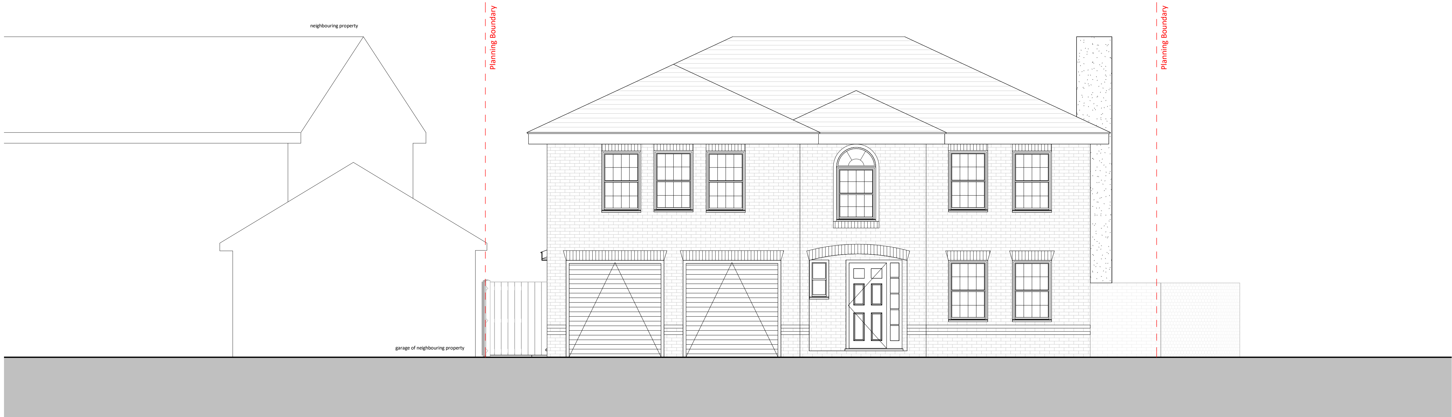
Front Elevation - EXISTING and PROPOSED