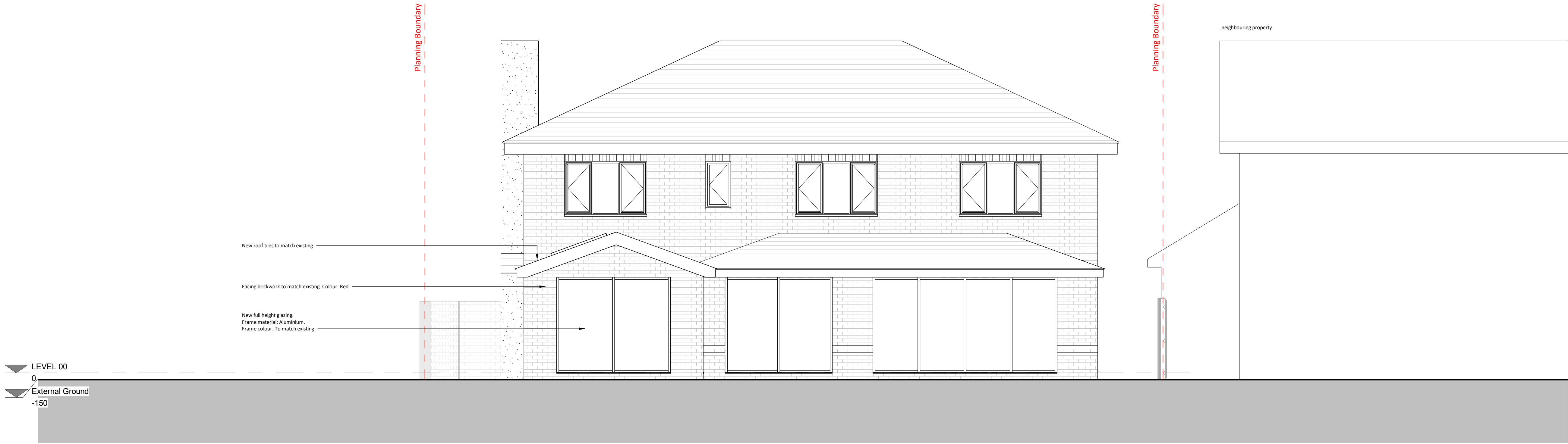
Rear Elevation - PROPOSED