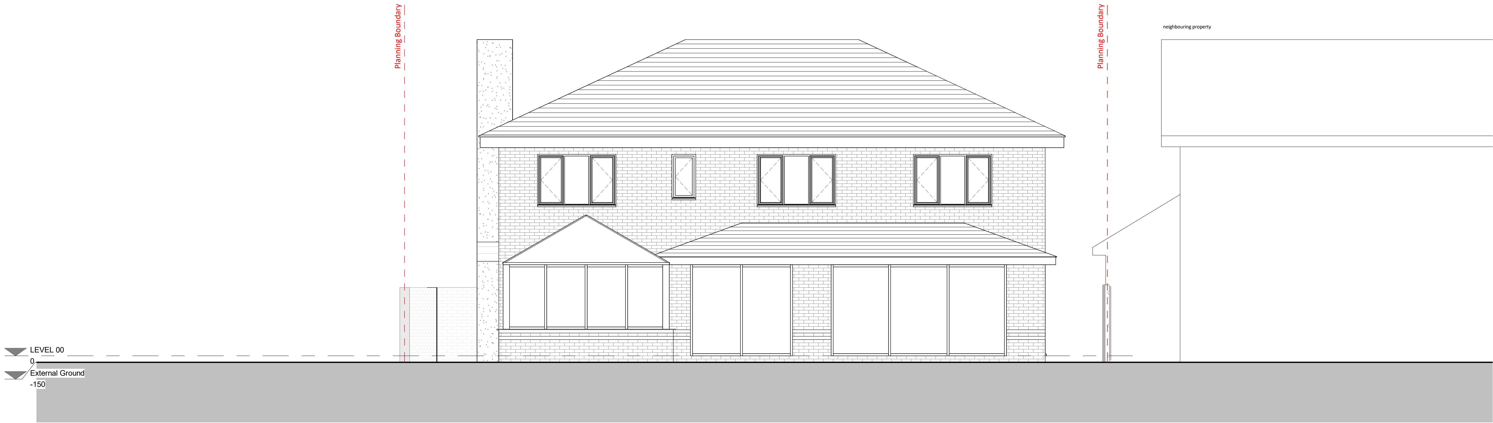
Rear Elevation - EXISTING