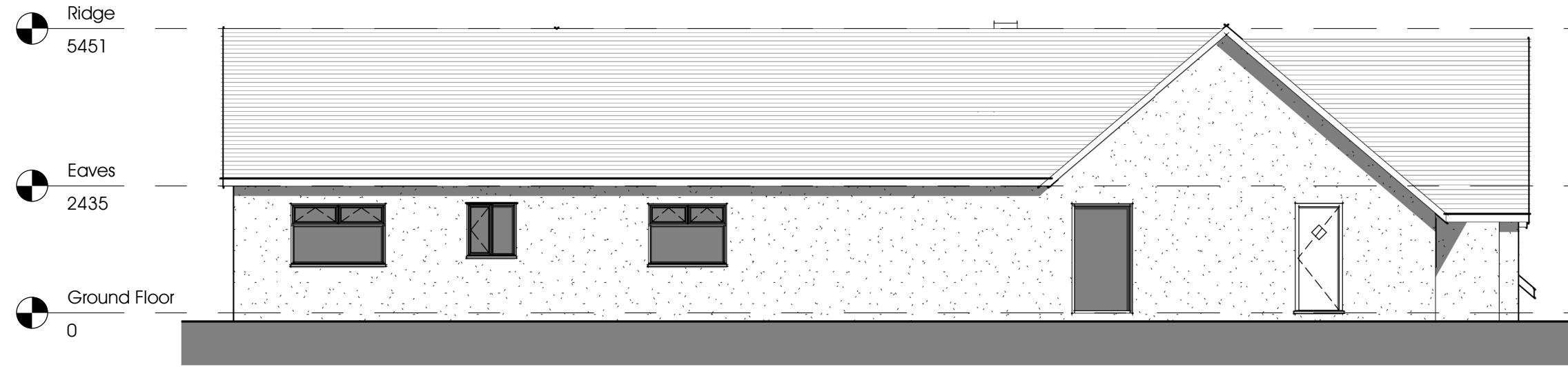
E3 Existing Rear Elevation 1 : 100