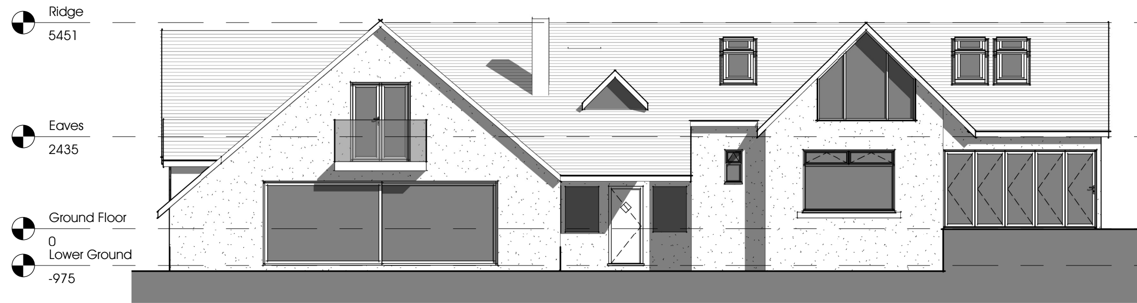
P1 Proposed Front Elevation 1 : 100