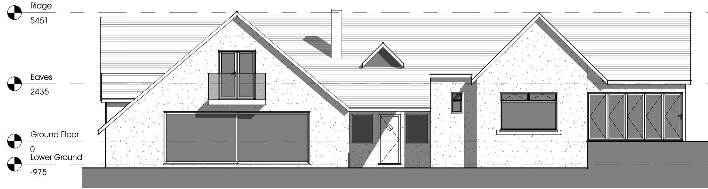
E1 Existing Front Elevation 1 : 100