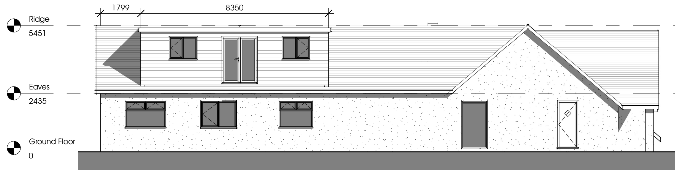
P3 Proposed Rear Elevation 1 : 100