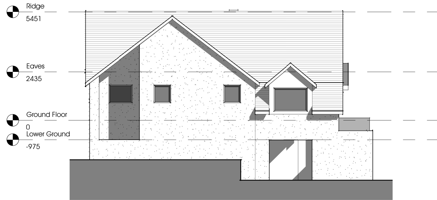
E2 Existing Side Elevation 1 : 100