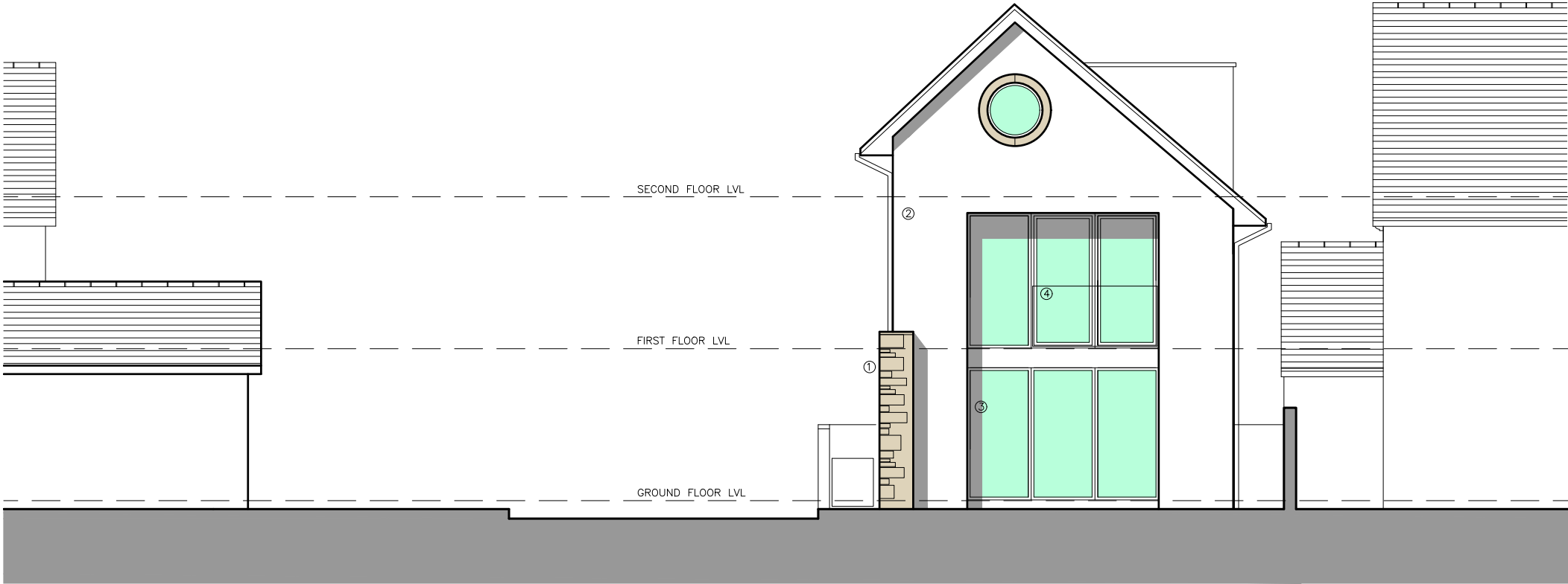
PROPOSED NORTH EAST ELEVATION (4)

©aw+a architects ltd 2020 | This Drawing is to be read in conjunction with all other project associated drawings and information. Do not scale from this drawing. Report all errors, omissions and discrepancies to drawing author prior to construction or manufacture. This drawing is copyright and is the property of aw+a architects ltd