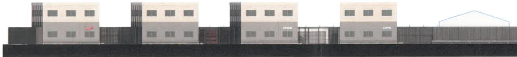
Site side elevation