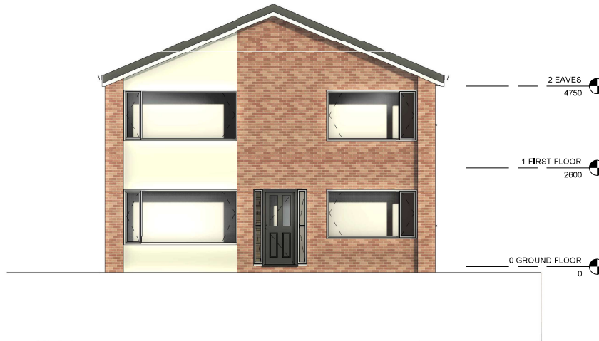
3 EXISTING SOUTH EAST 1 : 50