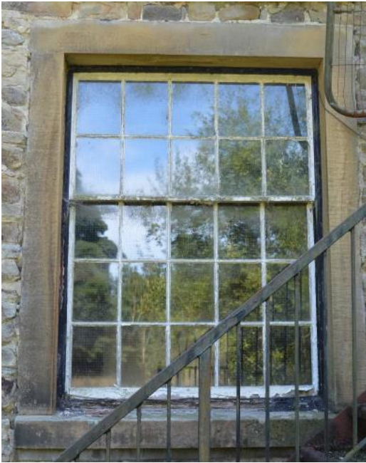
Close up of the safety glass

Glazing type – remove existing commercial safety glass glazing and replace with double glazing.