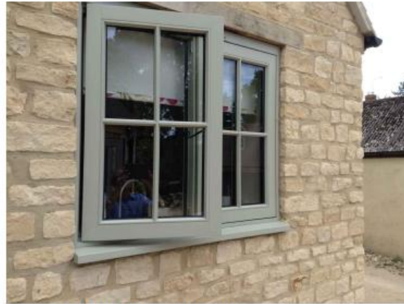
Proposed Painted Timber Windows