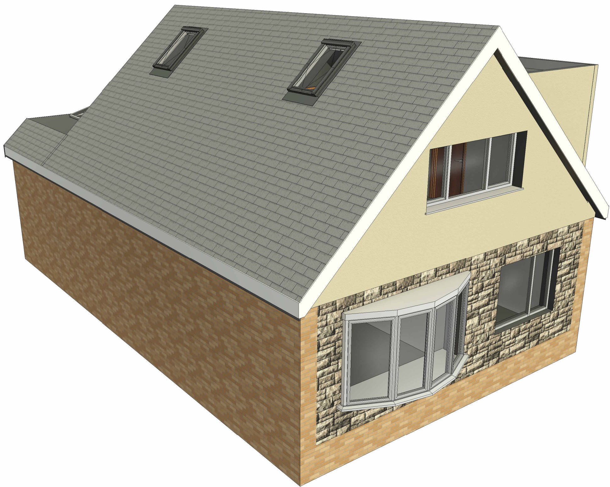
2 3D View 2