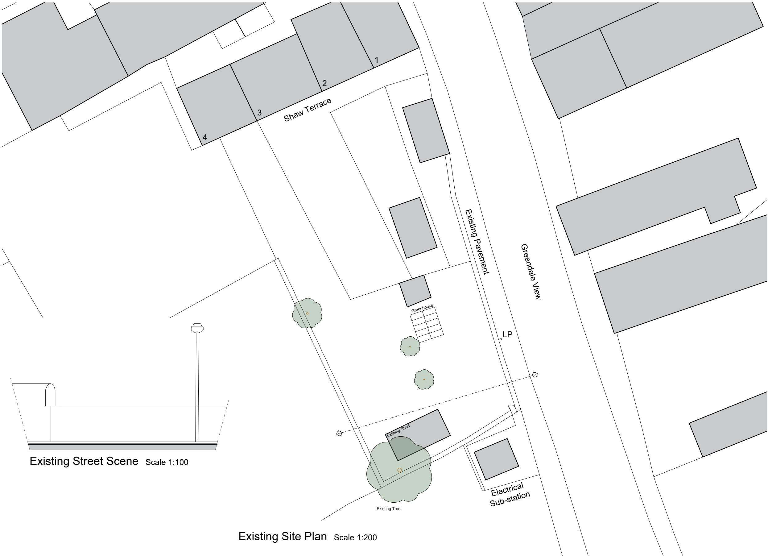
Existing Street Scene Scale 1:100