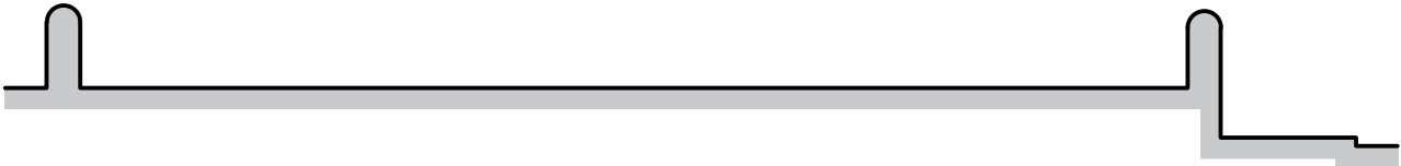
Existing Section A-A Scale 1:100