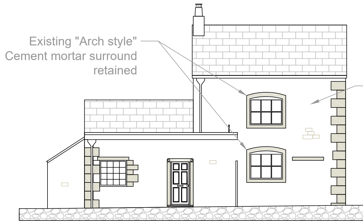
North Elevation to be repaired (Rear view from Malt Kiln Lane)