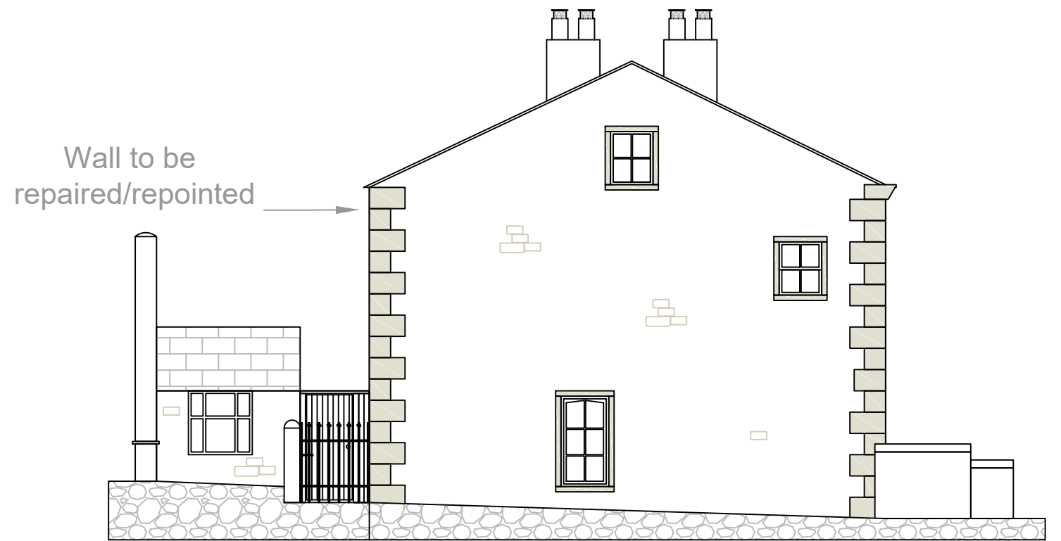
West Elevation (Roadside view from Malt Kiln Lane)