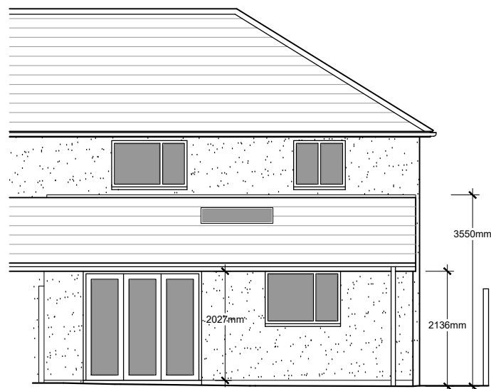
South East (Rear) Elevation