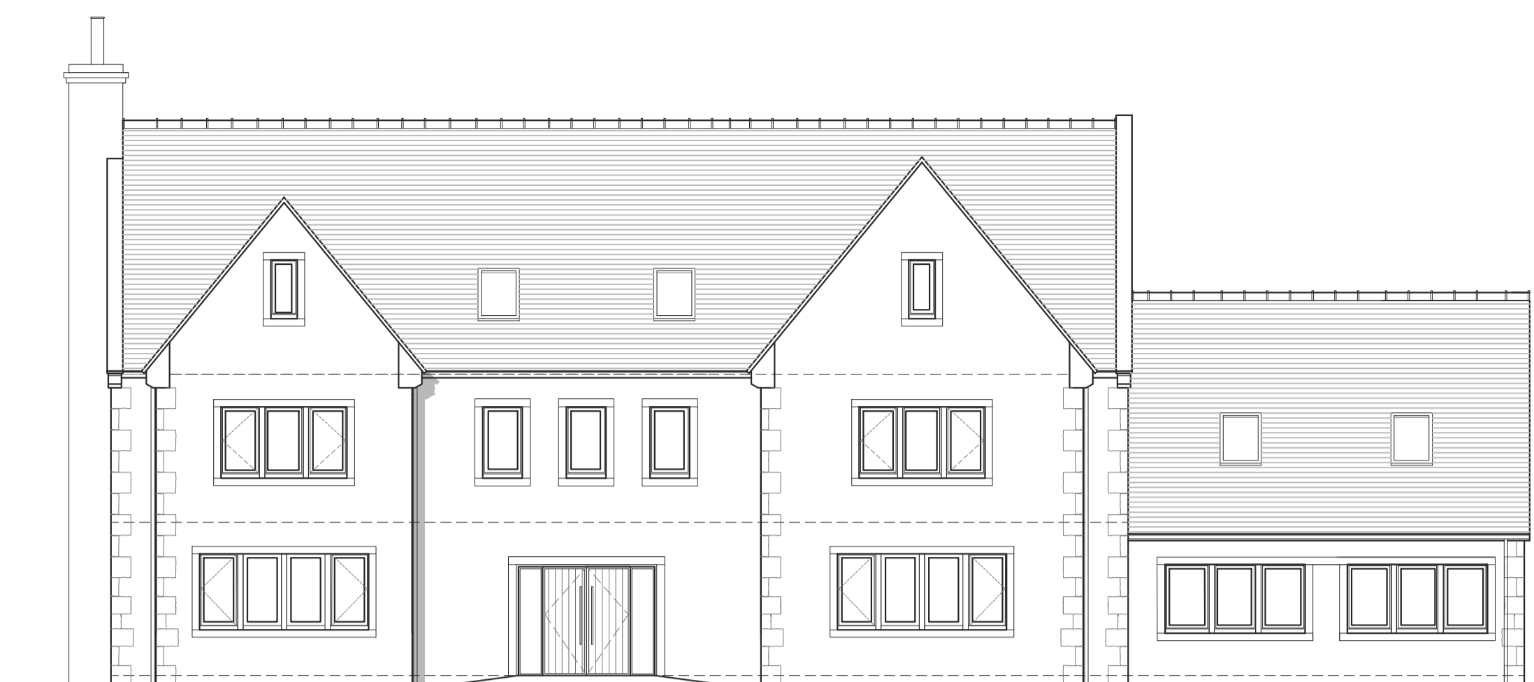
PROPOSED SOUTH ELEVATION Scale 1:100

This drawing is to be read in conjunction with all relevant designers, consultants and specialist drawings and specifications. The designer is to be notified of any discrepancies before proceeding. Do not scale from this drawing. All dimensions and levels are to be checked on site. All work carried out before planning and building regulation approval is obtained is at the contractor's risk. This drawing is subject to copyright.