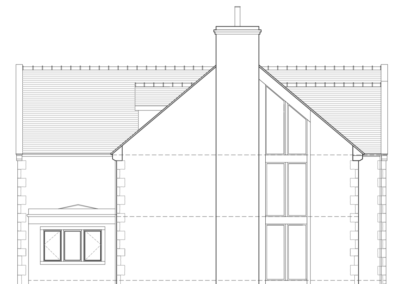
PROPOSED WEST ELEVATION Scale 1:100