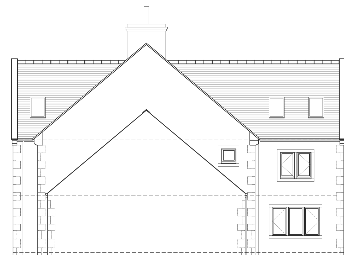
PROPOSED EAST ELEVATION Scale 1:100

Non - Material Amendment: Garage doors omitted for windows (fenestration to match existing)