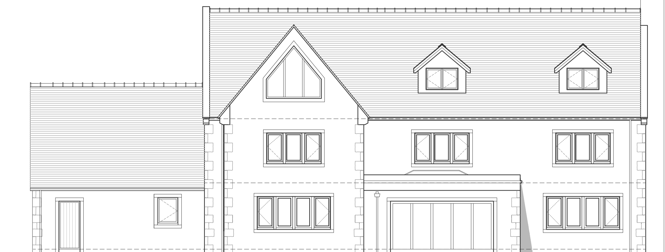
PROPOSED NORTH ELEVATION Scale 1:100