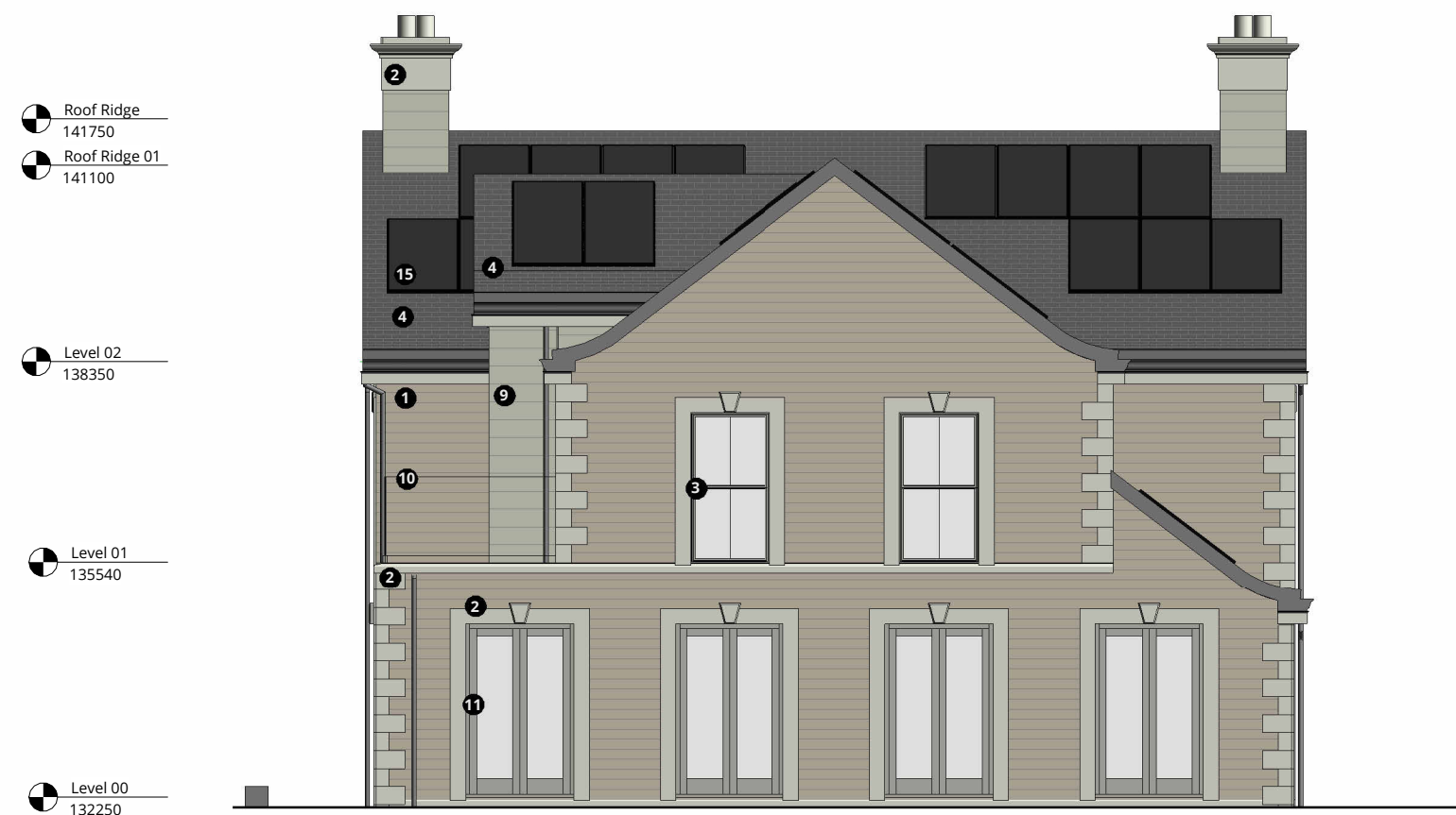
3 Rear Elevation (South East) 1:100