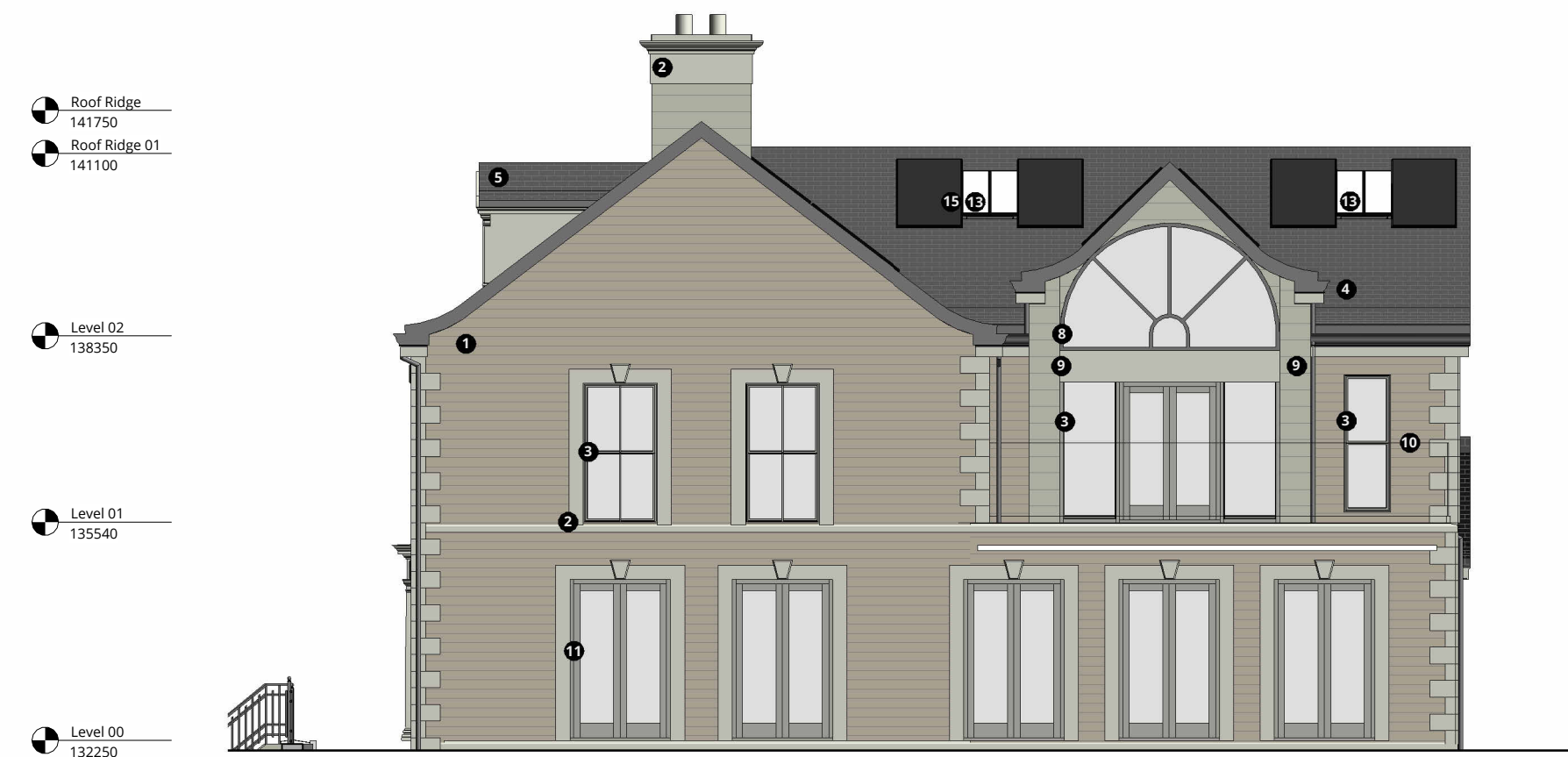
4 Side Elevation (South West) 1:100