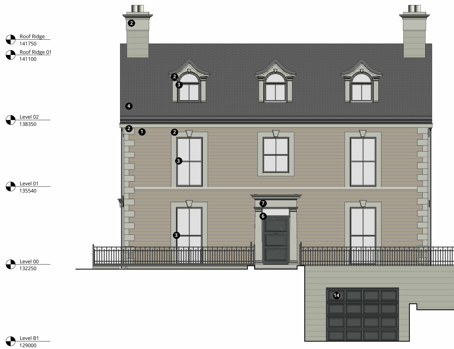
1 Front Elevation (North West) 1:100