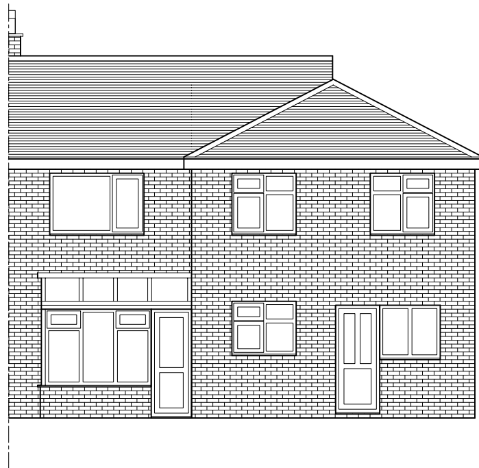
REAR ELEVATION (Existing)