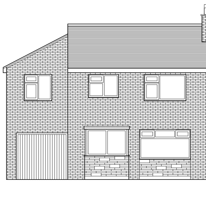
FRONT ELEVATION (Existing)