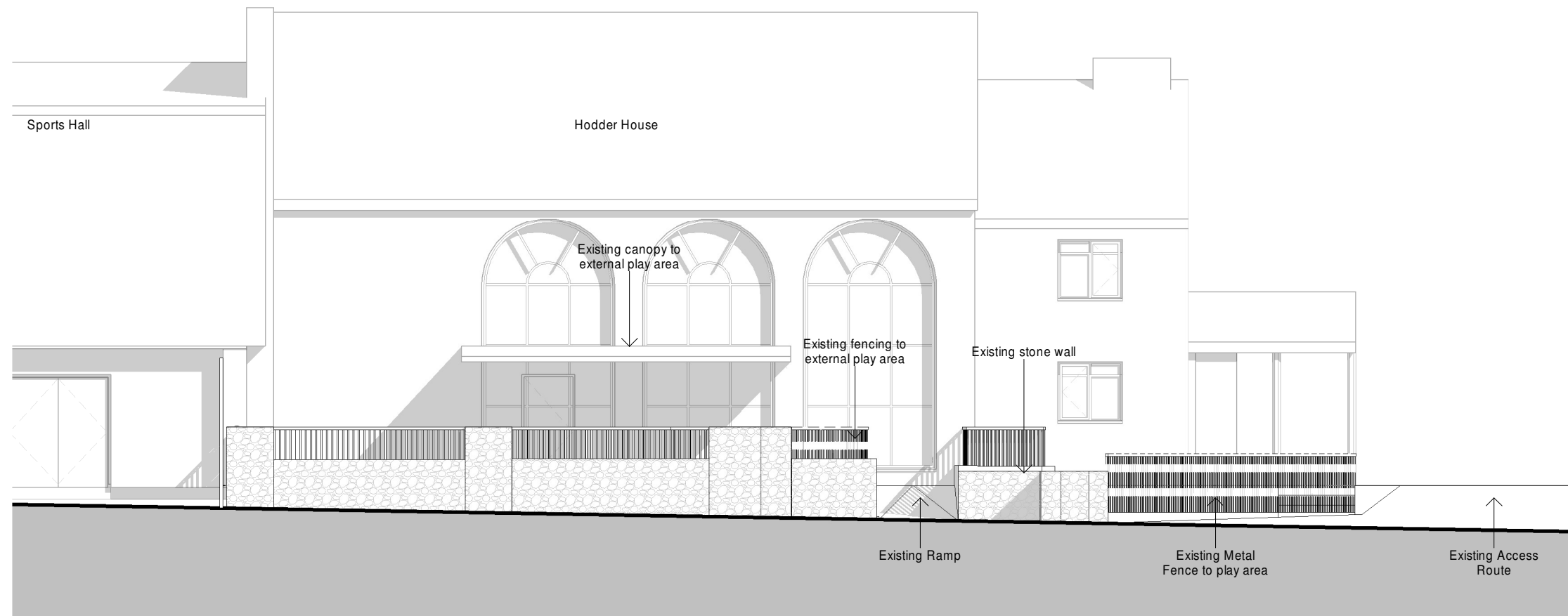
1 Existing SW Elevation