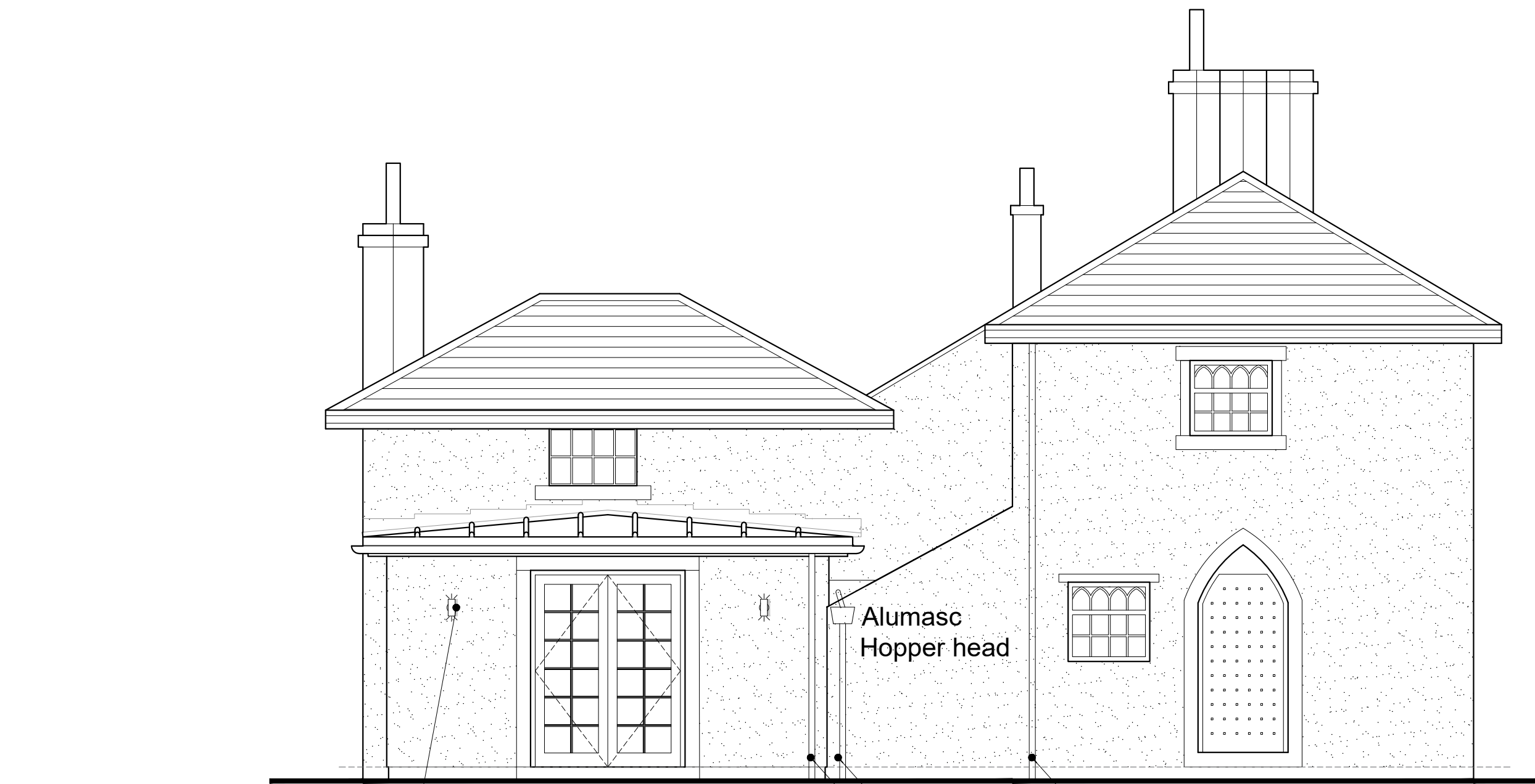
PROPOSED WEST ELEVATION SCALE 1:50