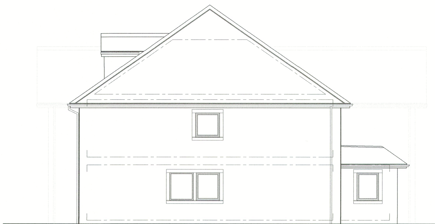
Existing West Elevation Scale 1:100