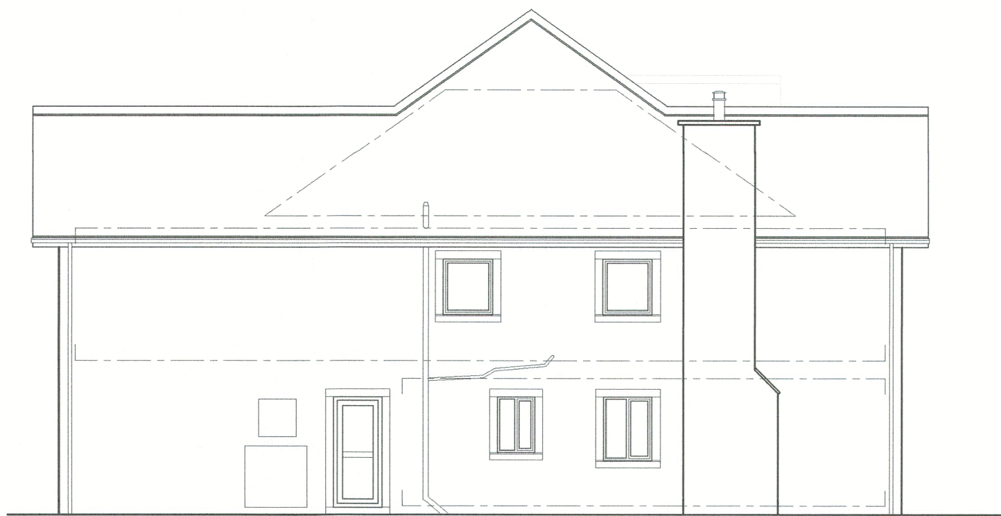
Existing East Elevation Scale 1:100