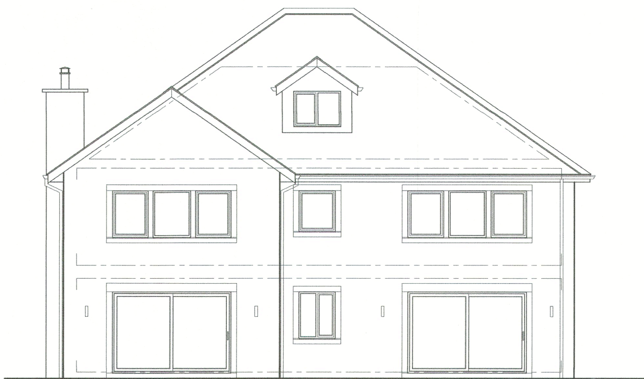
Existing North Elevation Scale 1:100