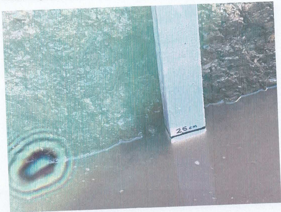
Finish timing @ 25cm