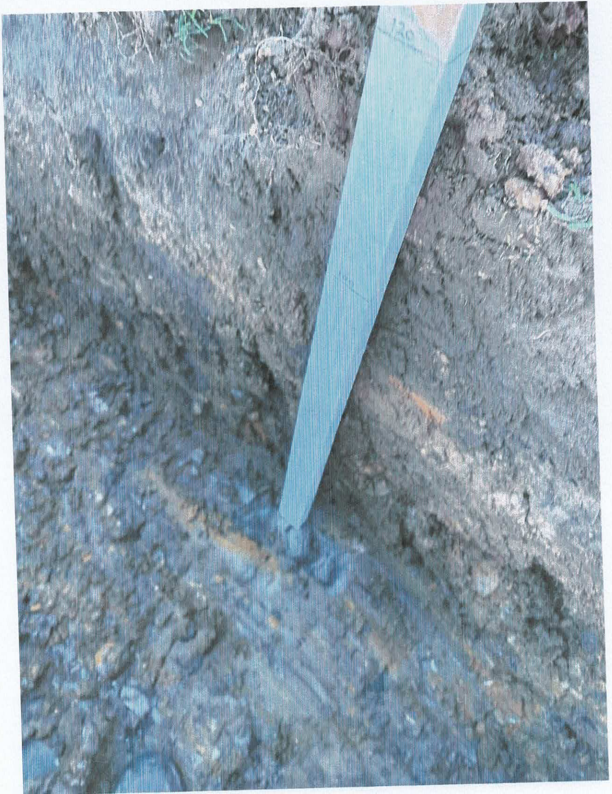
Trench 150cm long x 120cm deep x 60cm wide