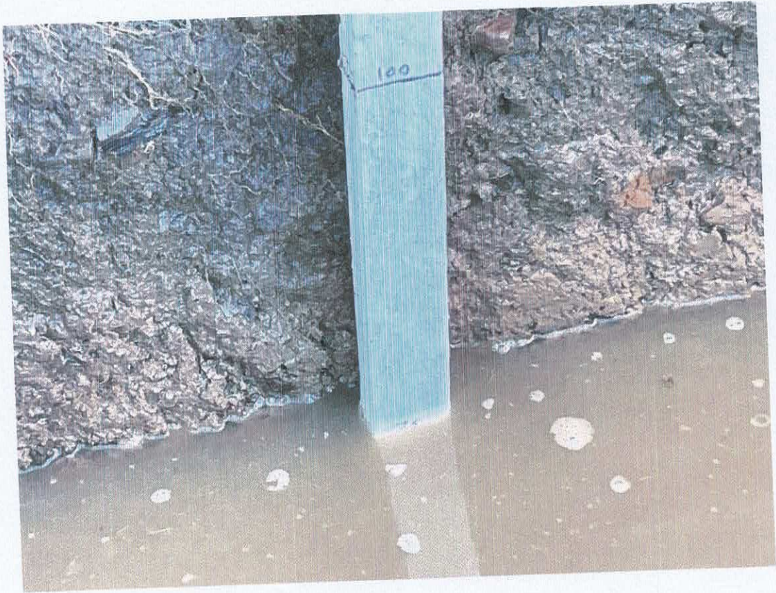
Start timing @ 75cm