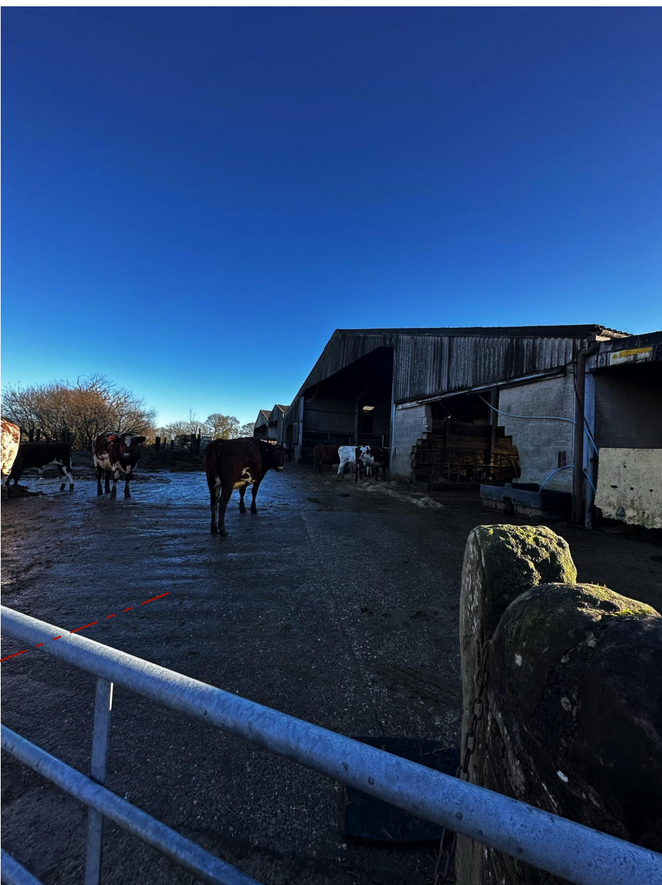
BARNs- COW AND MACHINERY BARNs

All dimensions are to be checked on site, any discrepancies are to be reported to the Architect before work commences. This drawing is to be read in conjunction with all relevant consultants and specialists drawings / documents, any discrepancies are to be reported to the Architect before the affected work commences. All structural components shown are indicative only. Details / calculations of structural members are to be provided by the Structural Engineer. This drawing is copyright. This drawing and the copyright, design rights and all other intellectual property. No licence or assignment of any such rights is granted hereunder. This drawing is not to be copied or divulged to a third party without written permission.