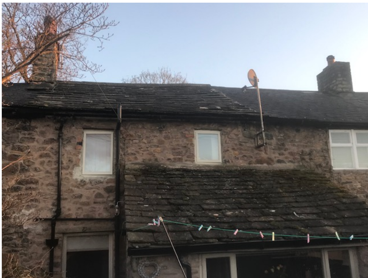
View from the rear