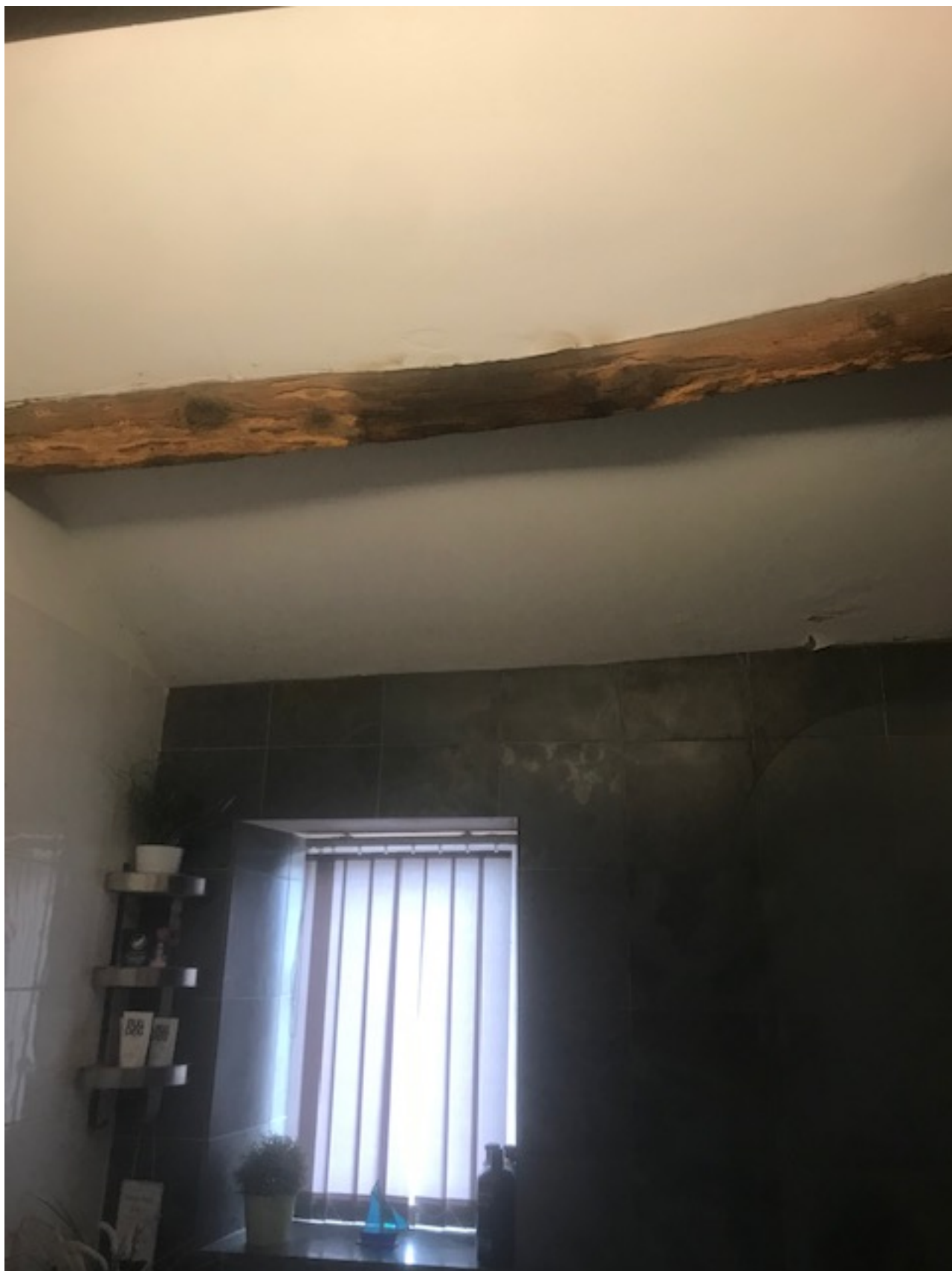
Internal view showing water damage