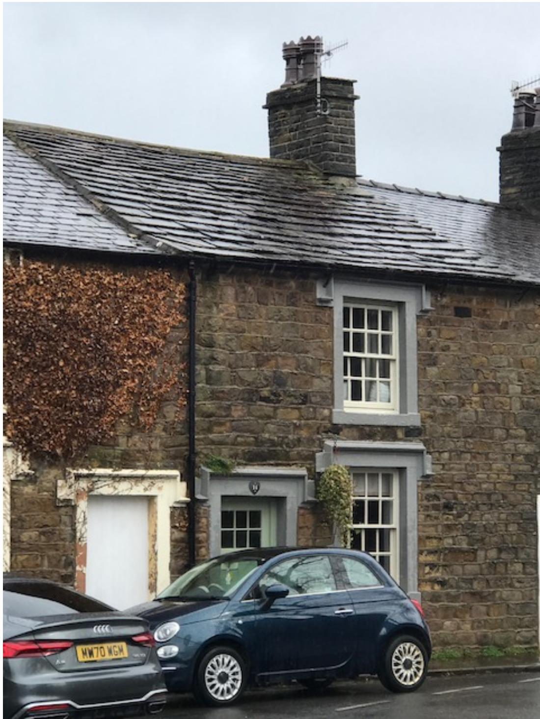
Closer view from Church Lane