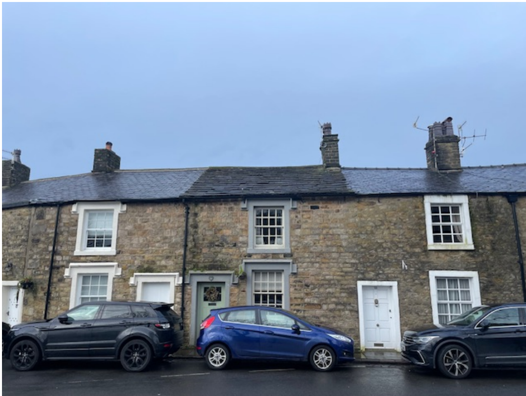
View of the front elevation