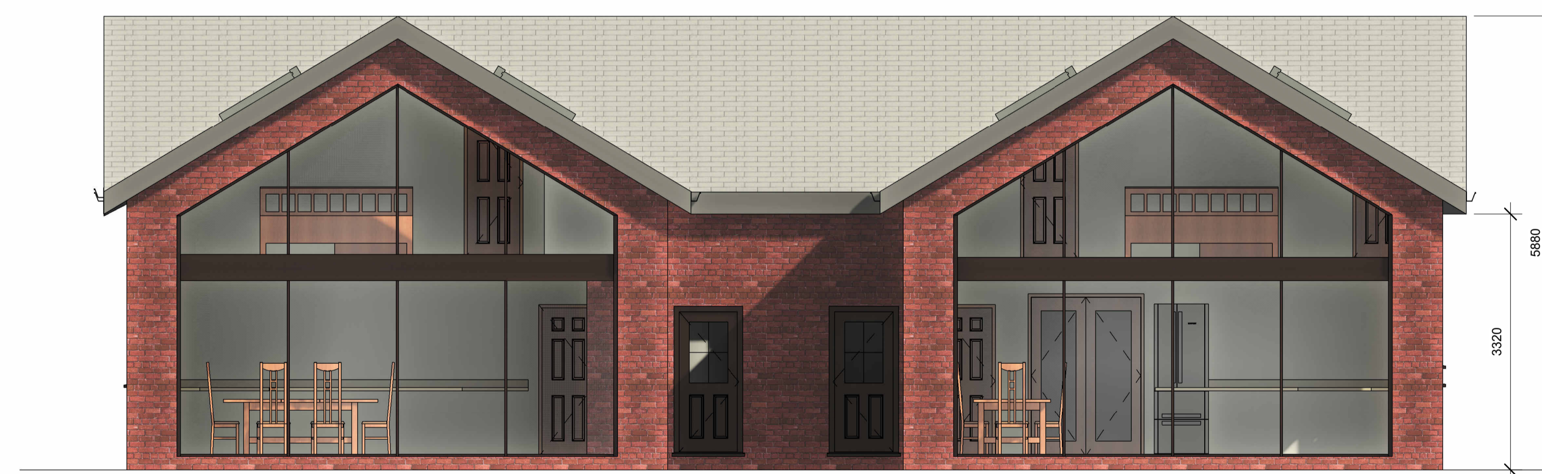
2 PROPOSED WEST 1 : 50