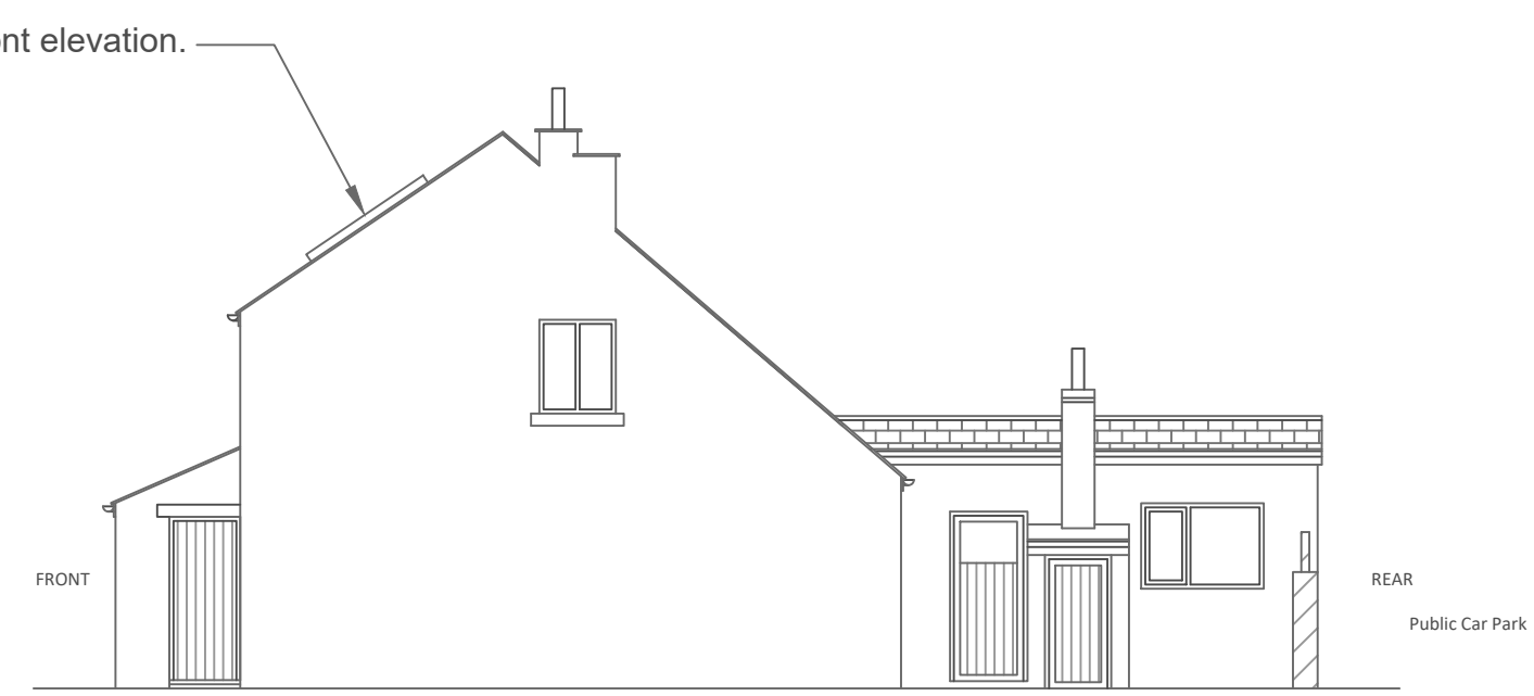
Proposed Right Elevation