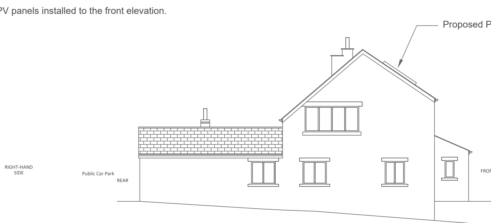
Proposed Left Elevation