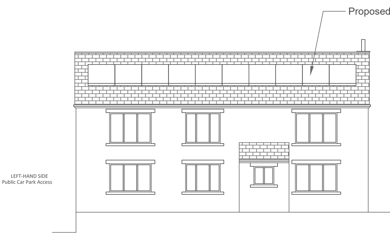
Proposed Front Elevation - Solar Panels ELEVATIONS SCALE 1:100