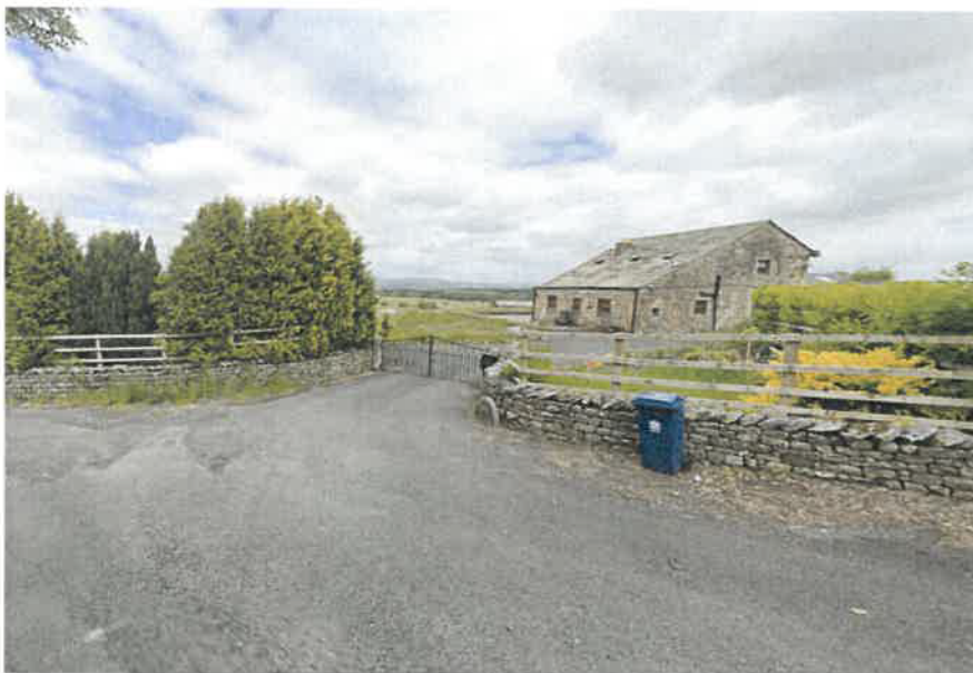
Existing access to Moorstones Barn off Knotts Lane

Access to the site would be taken from the existing property entrance off Knotts Lane and through the yard. A private equestrian facility would reduce the necessity for the applicants to transport horses several times a week and would therefore reduce large vehicles along Knotts Lane. Access to the proposed arena is to be taken through a 12ft timber gateway opposite the existing building.