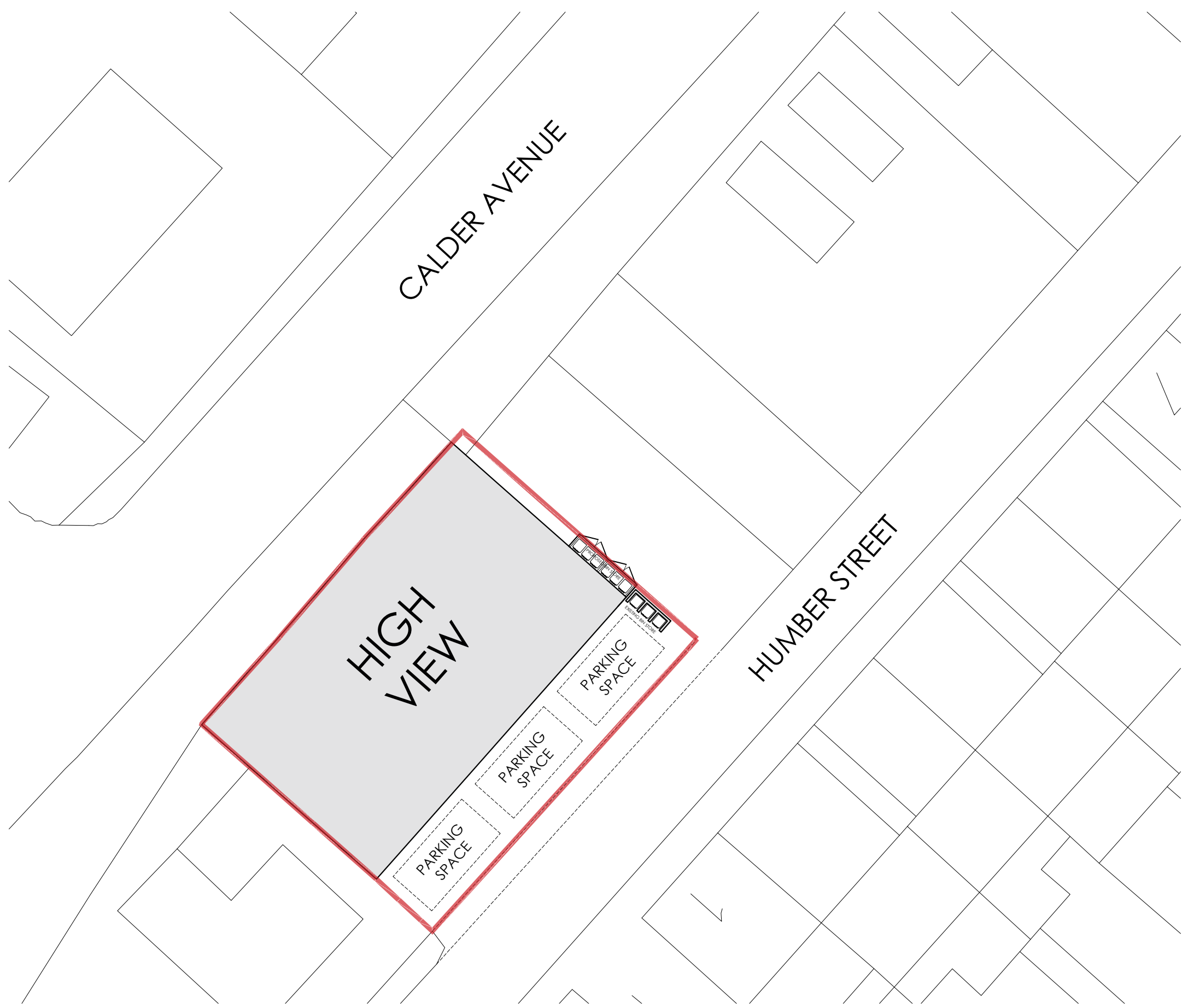
PROPOSED SITE PLAN - ILLUSTRATING PROPOSED PARKING PROVISIONS AND REFUSE BIN AND RECYCLING COLLECTION POINTS.