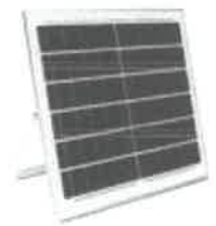
Solar Panel included