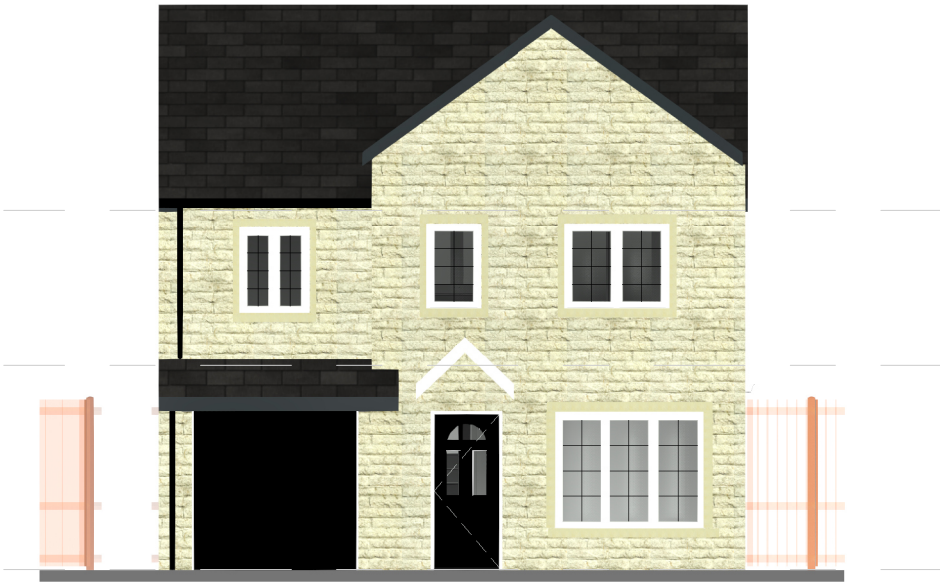
EXISTING NORTH ELEVATION 1:100