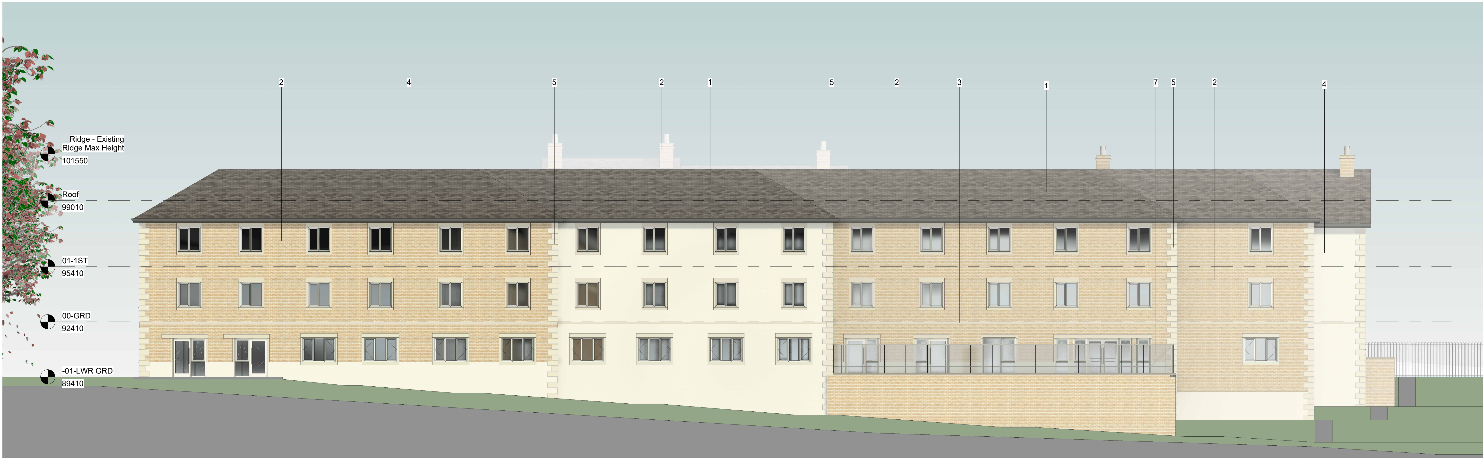
1 North Elevation 1 : 100