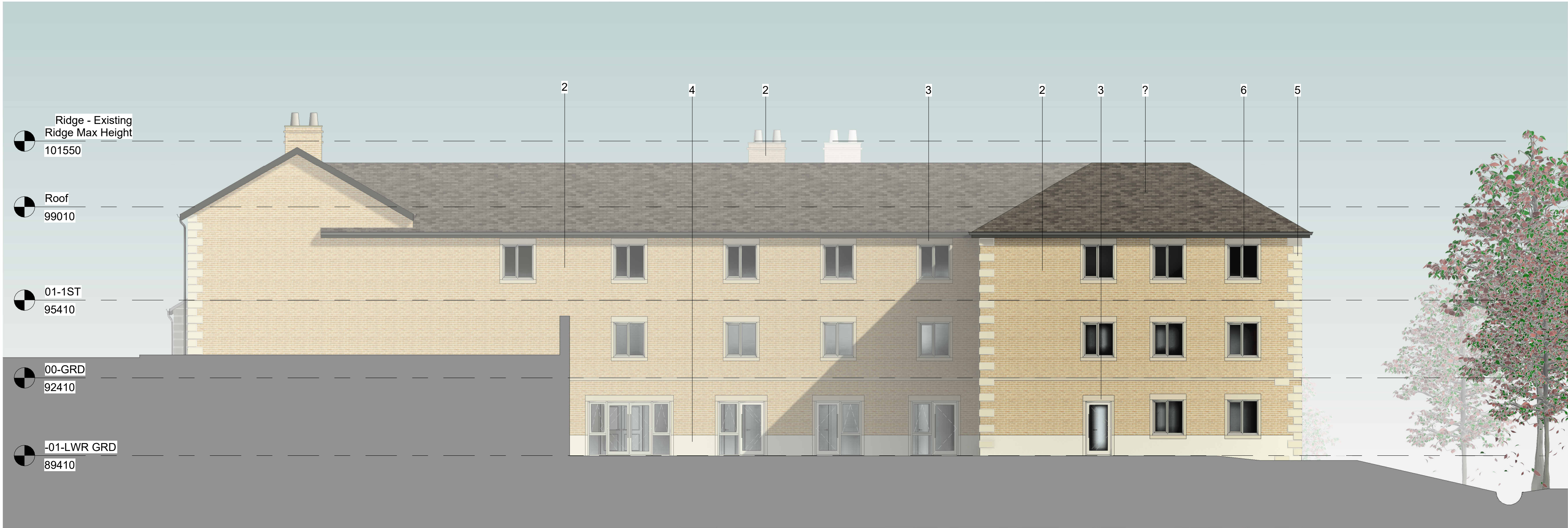
2 East Elevation 1 : 100