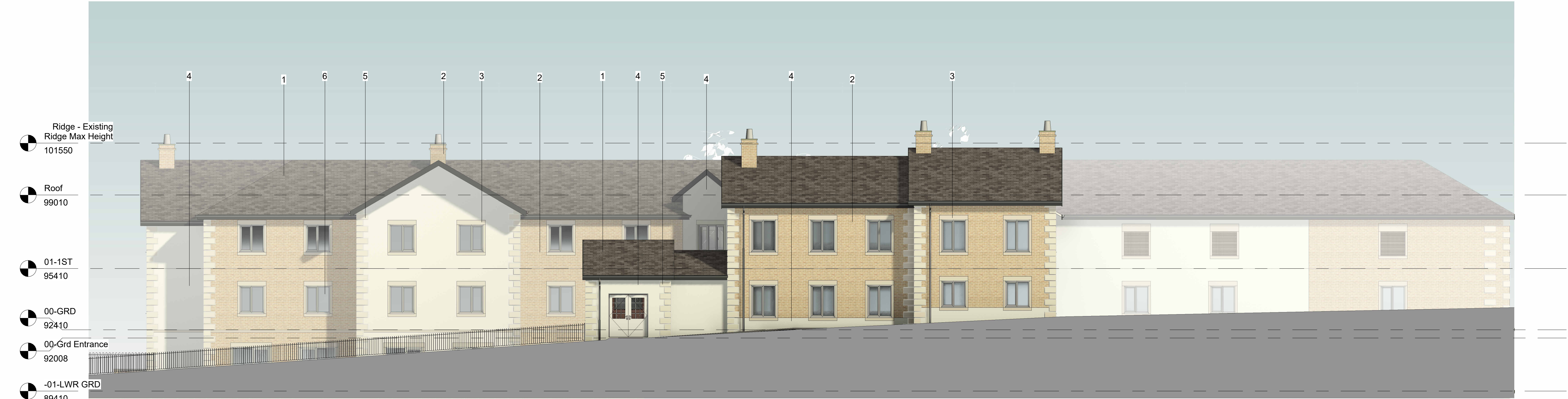
1 South Elevation 1 : 100