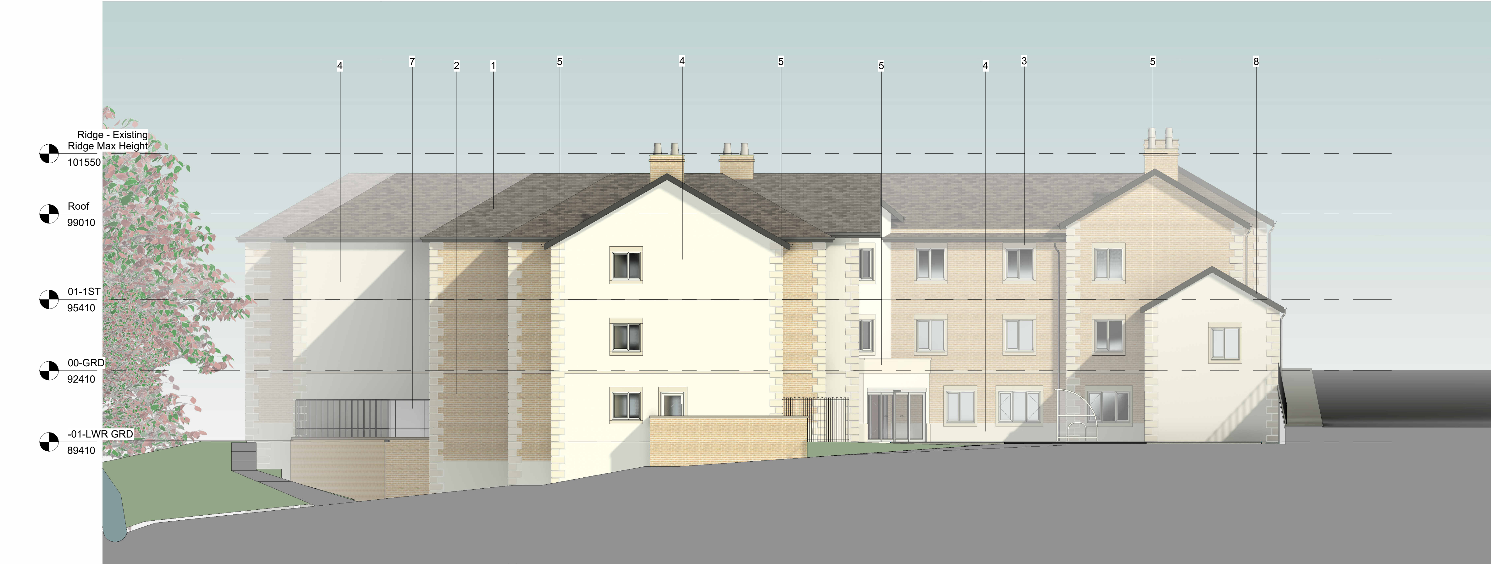
2 West Elevation 1 : 100