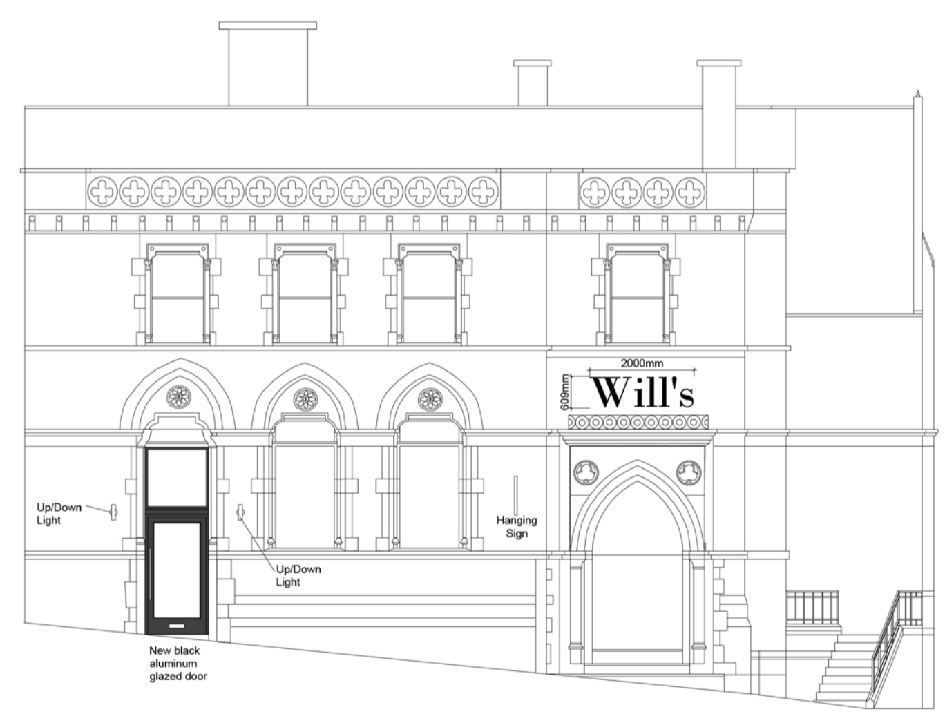
Proposed South East Elevation Scale 1:100