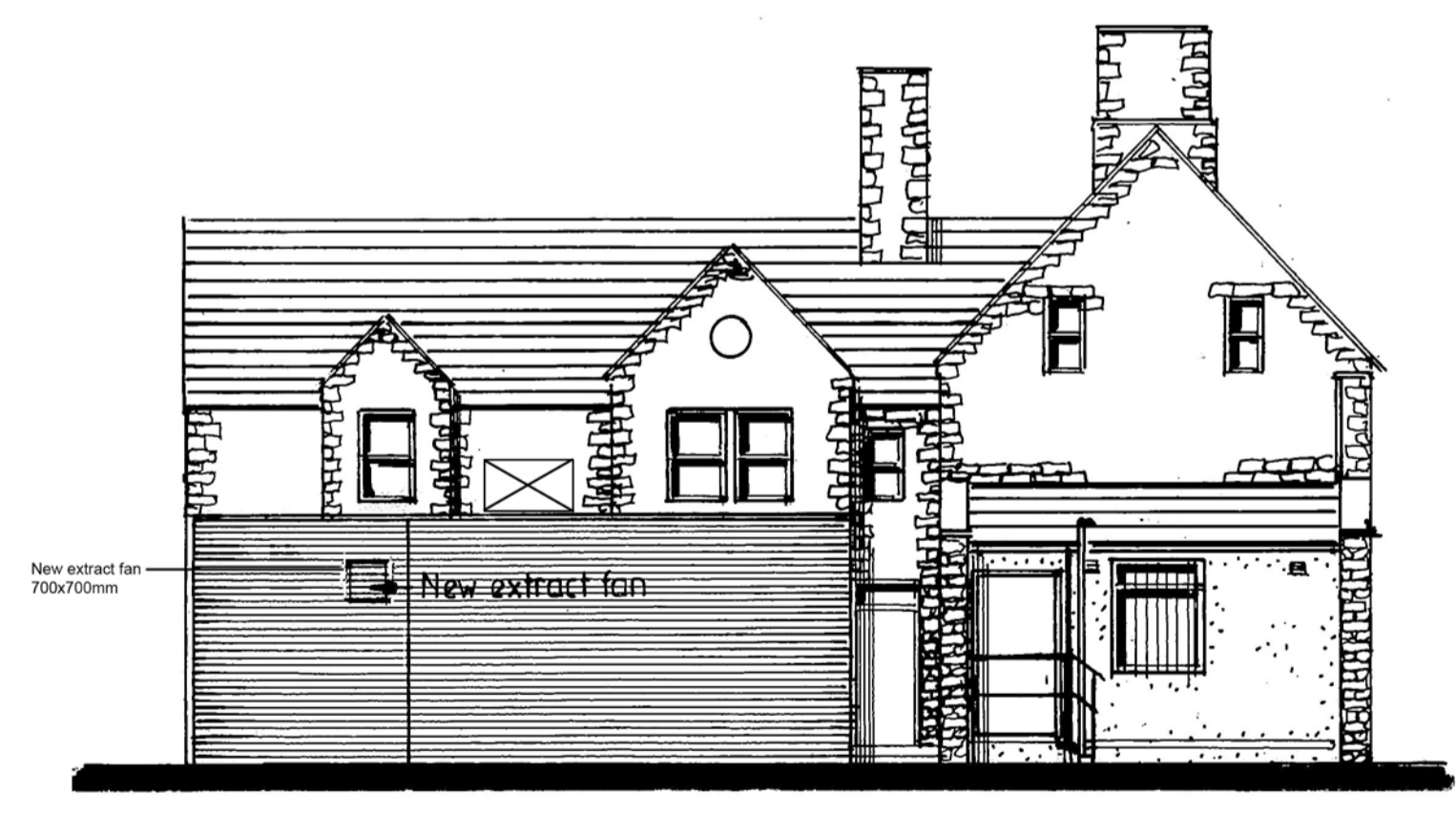
Proposed North West Elevation Scale 1:100