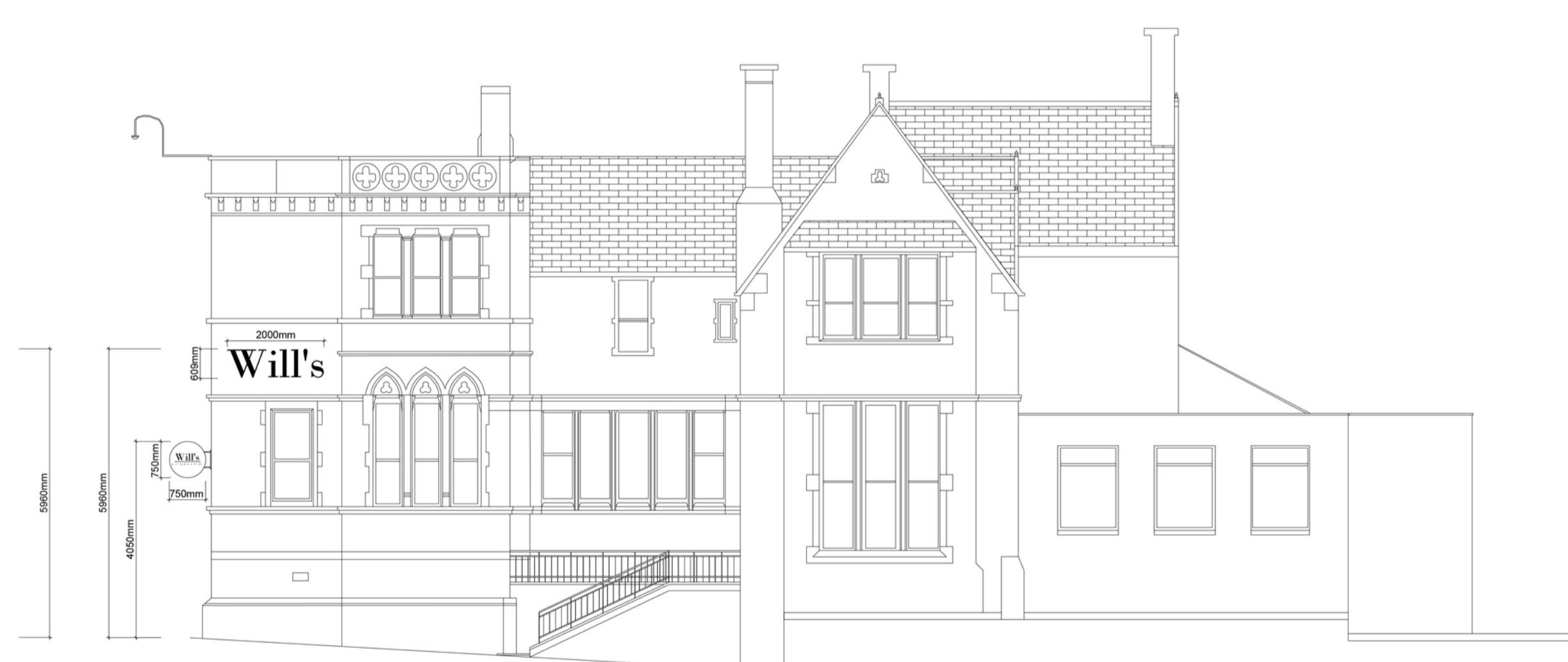
Proposed North East Elevation Scale 1:100