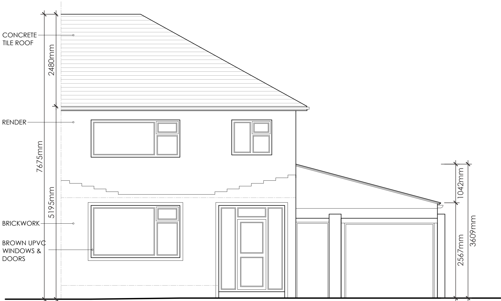
EXISTING FRONT (SOUTH WEST) ELEVATION