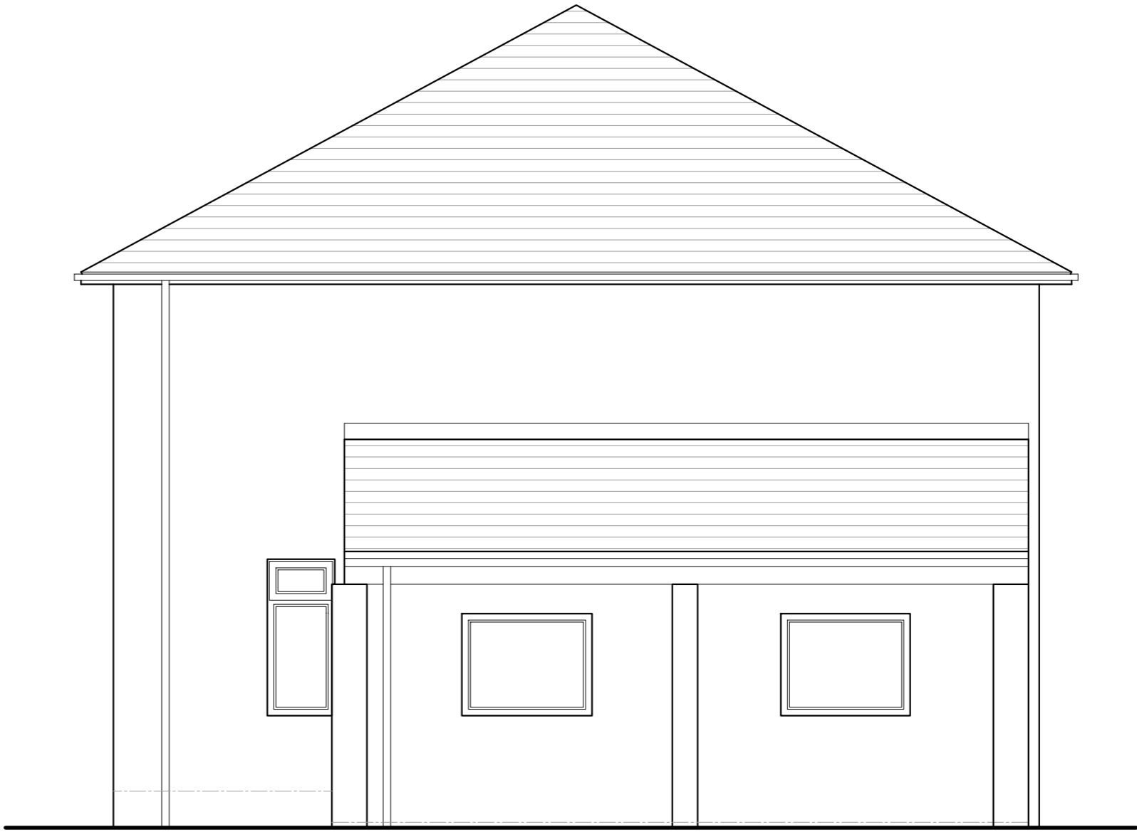
EXISTING SOUTH (SOUTH EAST) ELEVATION