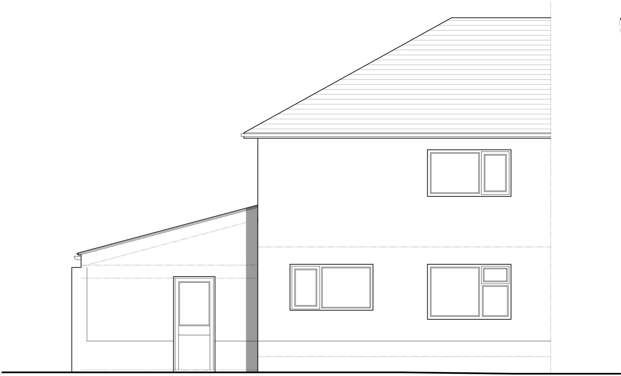
EXISTING REAR (NORTH EAST) ELEVATION