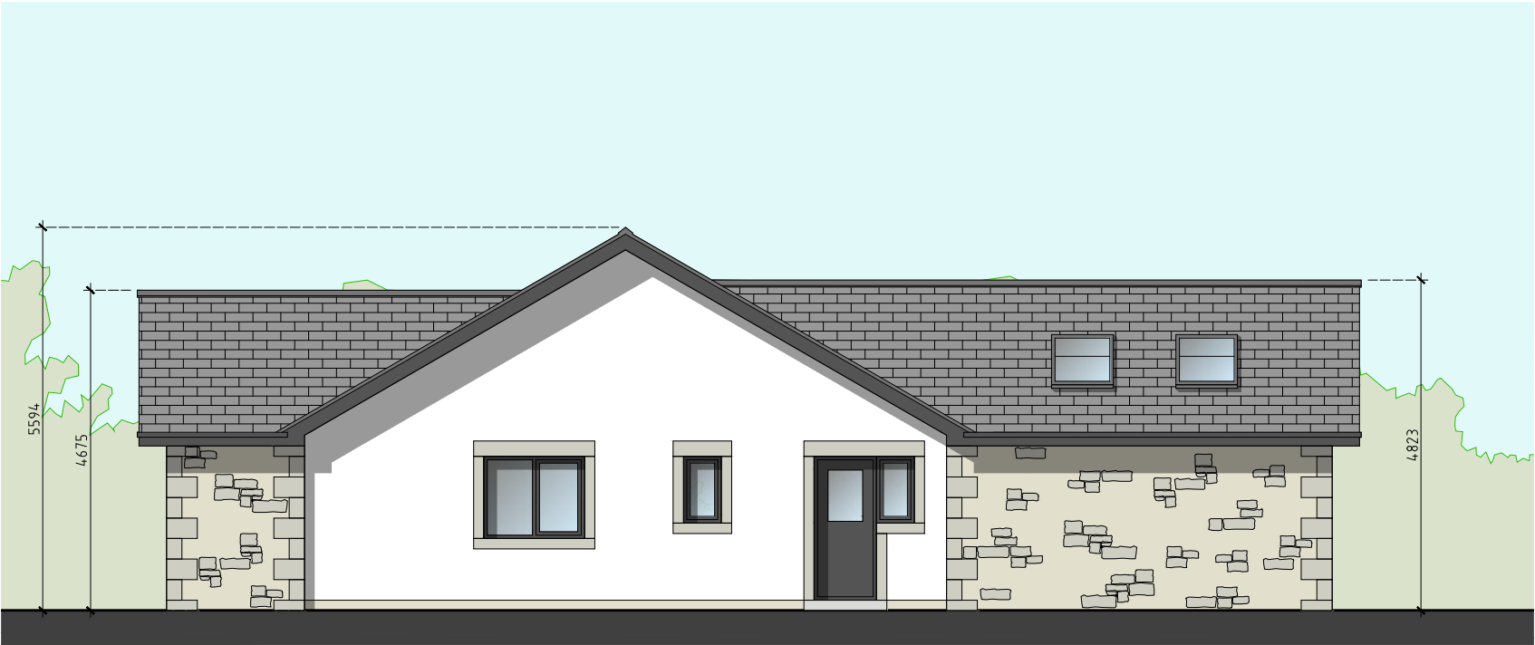
Side (North-East) Elevation