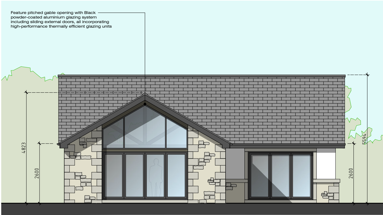
Rear (North-West) Elevation