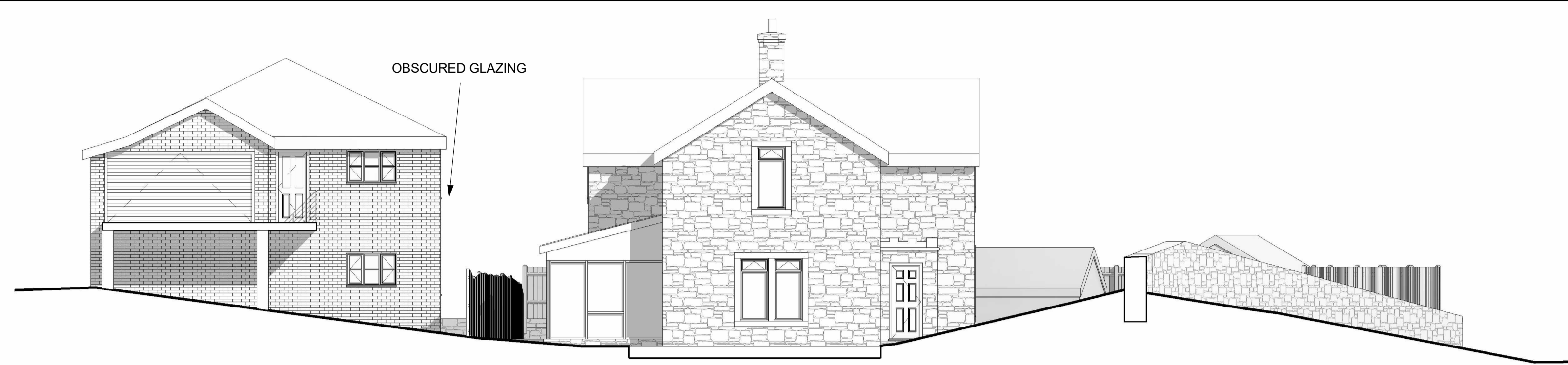
3 EXISTING EAST 1 : 100