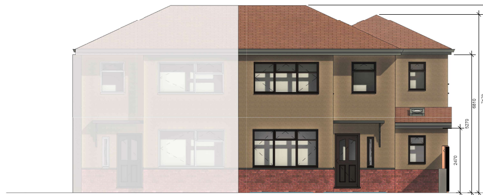
3 PROPOSED SOUTH 1 : 50