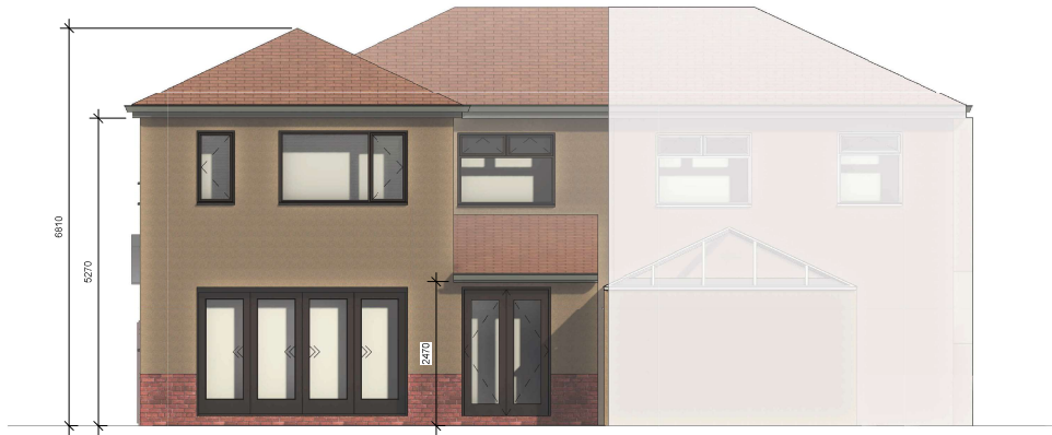
1 PROPOSED NORTH 1 : 50