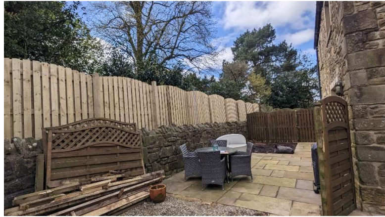
Figure 2 - Picture of fence and established trees/shrubs to rear of application site

The proposed works are to the rear of the property which looks out on to the garden on Waddington Hall. However, the property is well screened from Waddington Hall by well-established trees/shrubs along with a large timber fence which has been erected by the owner of Waddington Hall (figure 2). Access to the property is from Branch Road via a single access road which is also used to access the car park to the rear of Waddington Arms. The properties along Branch Road provide a screen effectively 'hiding' the property. In addition, the rear of the property is at 90 degrees to Branch Road further reducing any views of the proposed works. The location and orientation of the property means that the proposed works will not be seen as part of the wider conservation area.