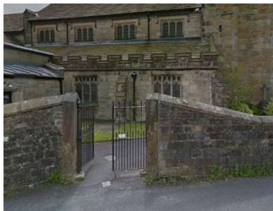
Figure 1 - St Helen Church

When carrying out any works on a building within a historic setting it is important to ensure that the proposed works do not adversely erode the historical importance of the area. The property is located in the Waddington Conservation Area. Approximately 100m to the southwest of the site is St Helen's Church, which is a Grade II* listed building, but this is not visible from the site. There is a total of 11 of listed heritage assets within the Waddington Conservation Area most notably being the Church of St Helen. See figure 1.