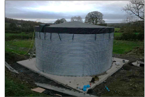
Image of Existing Water Tank