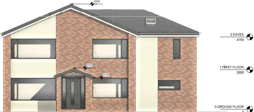
3 PROPOSED SOUTH EAST 1 : 50