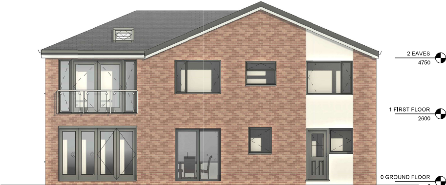
2 PROPOSED NORTH WEST 1 : 50