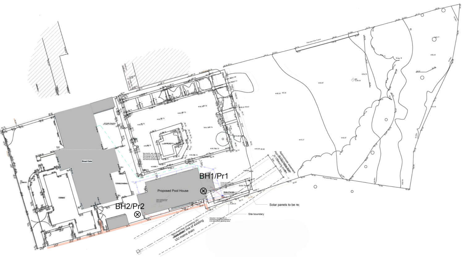
EXISTING SITE PLAN SCALE 1:200