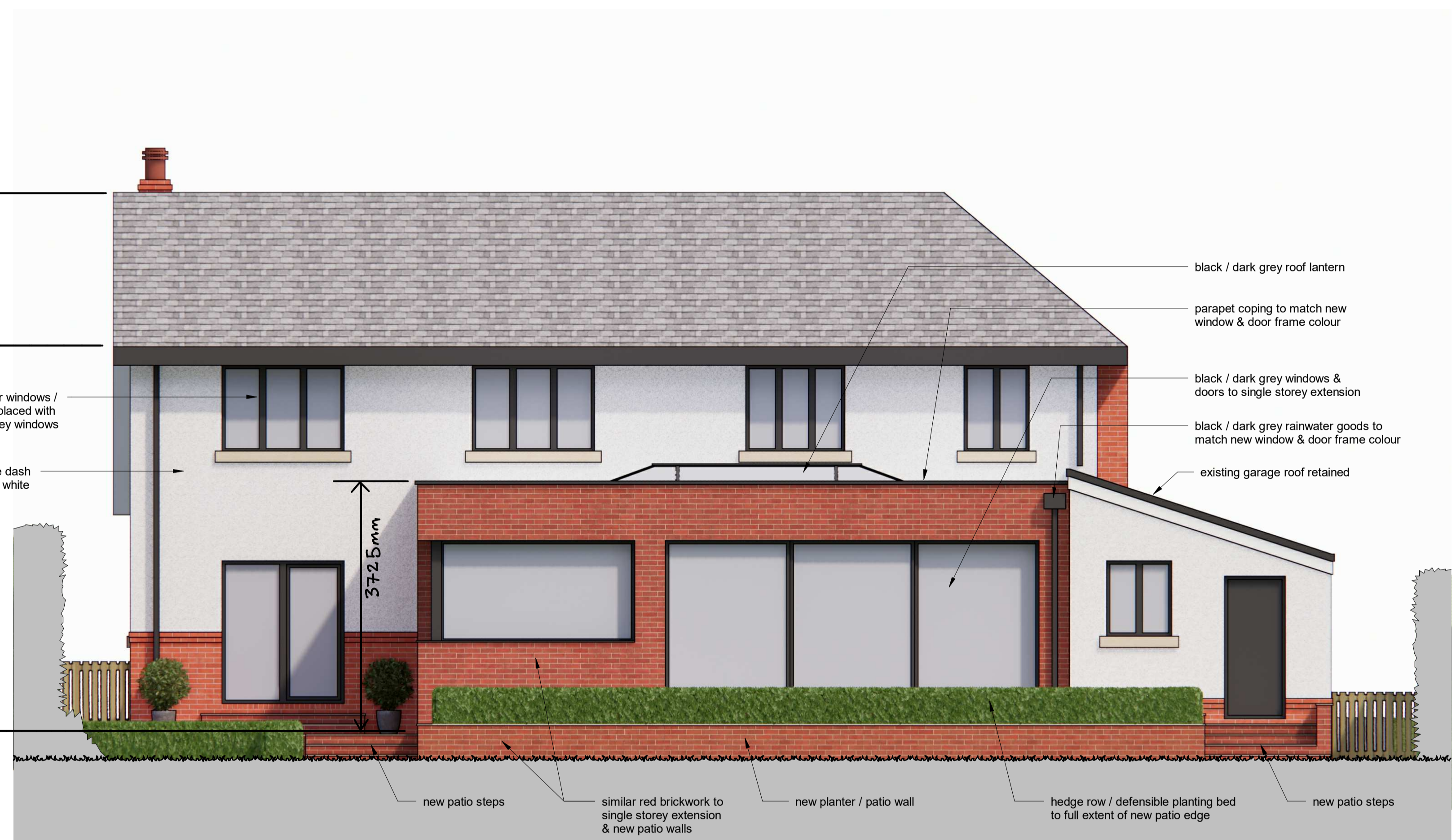
Proposed Side Elevation 1:50