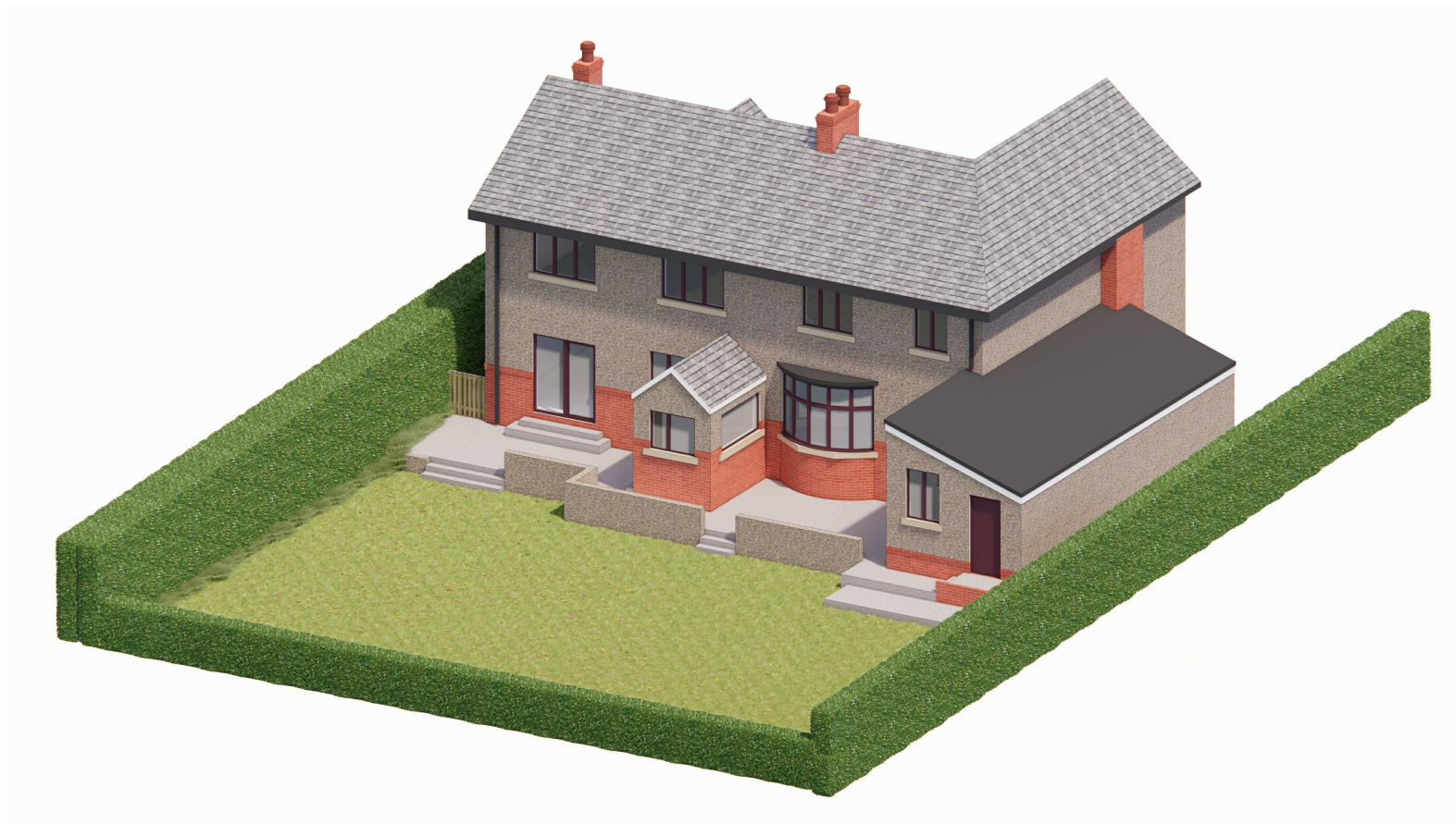
Existing rear arrangement