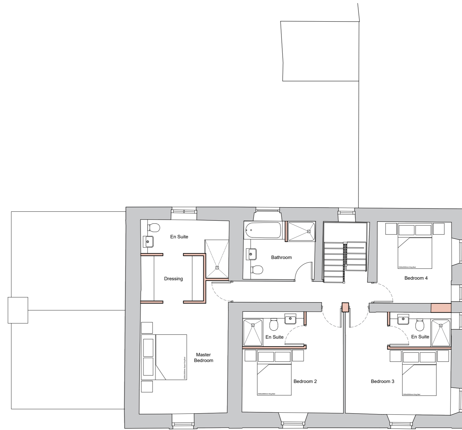
Proposed First Floor Plan Scale 1:100